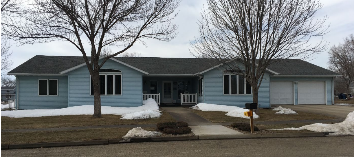
Administrative offices for Countryside