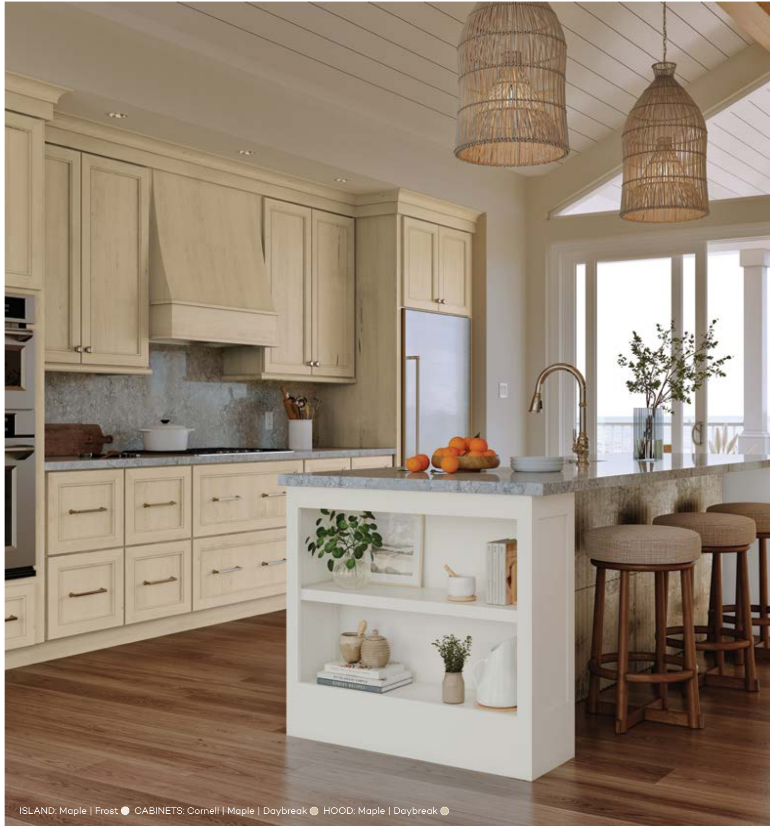
ISLAND: Maple | Frost ● CABINETS: Cornell | Maple | Daybreak ● HOOD: Maple | Daybreak ●

Hand-rubbed to bring out wood's natural beauty.