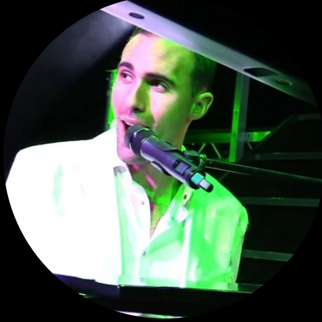
JESUS MUSICAL DIRECTOR