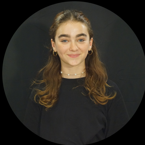
GIA CLASS ASSISTANT