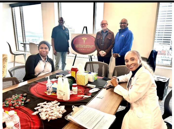
Flu Vaccines for The Greater Memphis Chamber