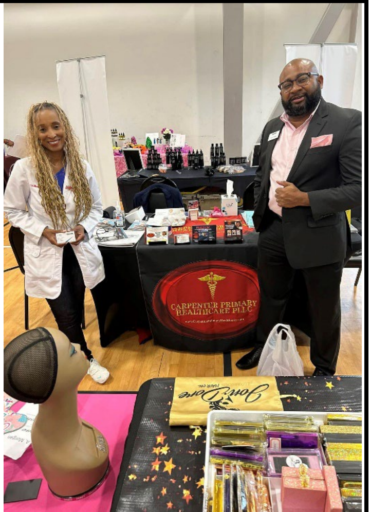
Mid-South Small Biz - Whitehaven