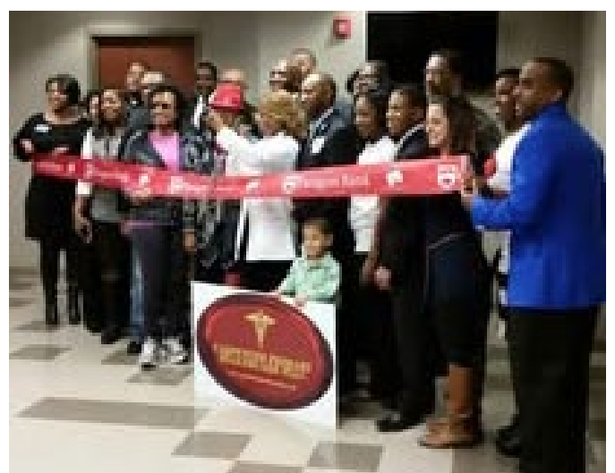
Grand Opening Feb 7, 2015