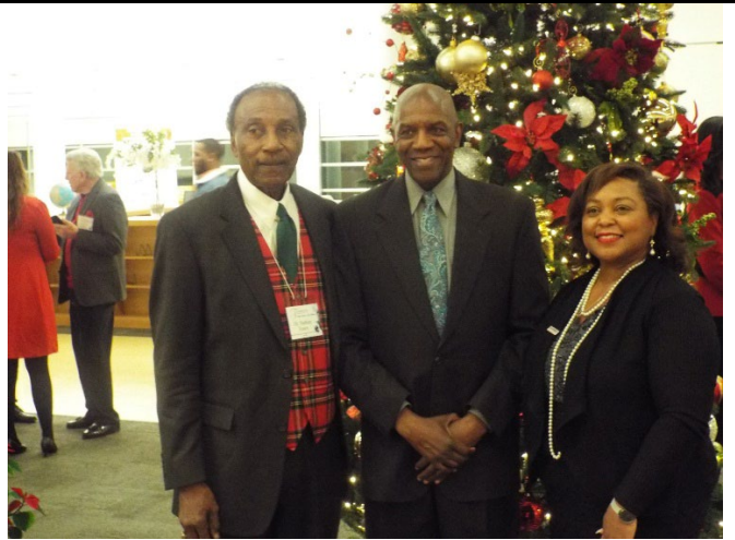
Scholarship Support to Southwest TN Community College