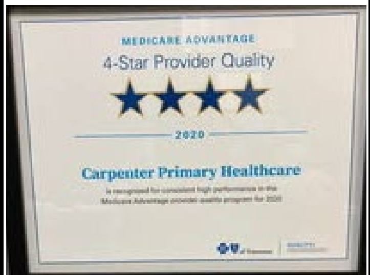
Blue Cross Blue Shield 4 Star Provider Award