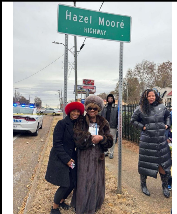
Mayor of Whitehaven Street Naming