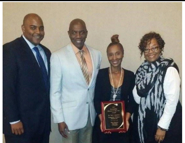
2016 Black Business Association Outstanding Business of the Year Award