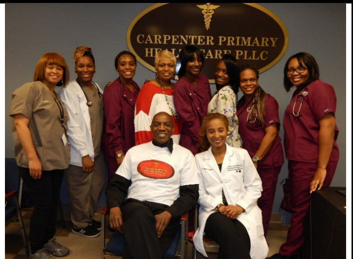
Health Screening Service Activity with Vatterott Medical Assistant Students