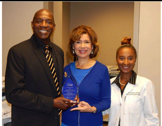
2016 Small Business Association Small Business of the Year Award