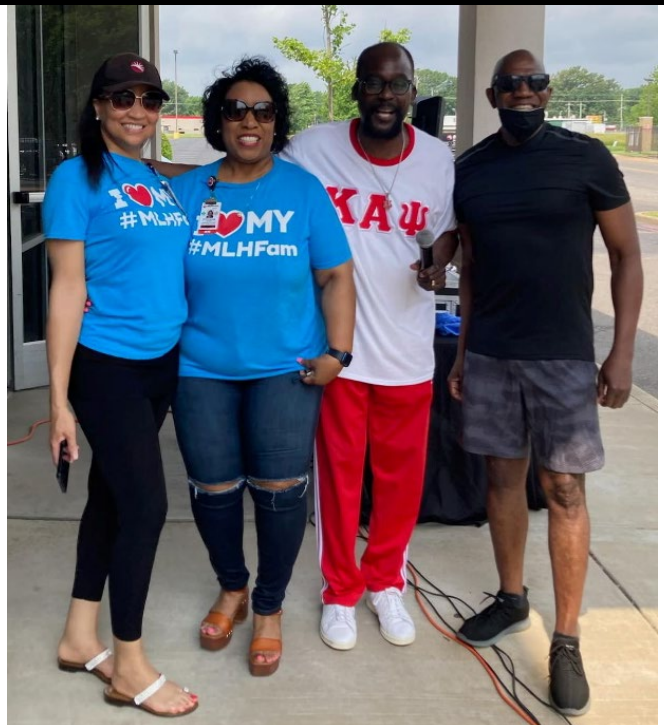
Methodist Spring Health Fair