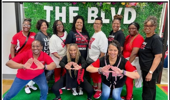
Health Fair with Delta Sorors