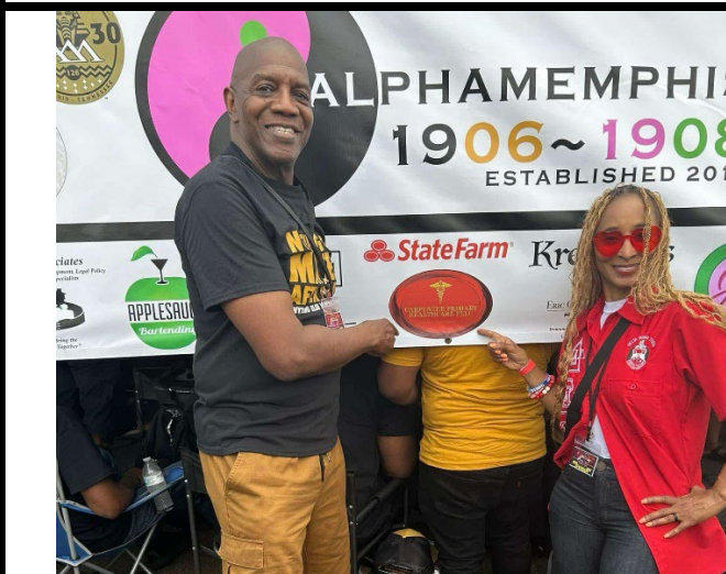
Tailgate sponsors for Southern Heritage Classic