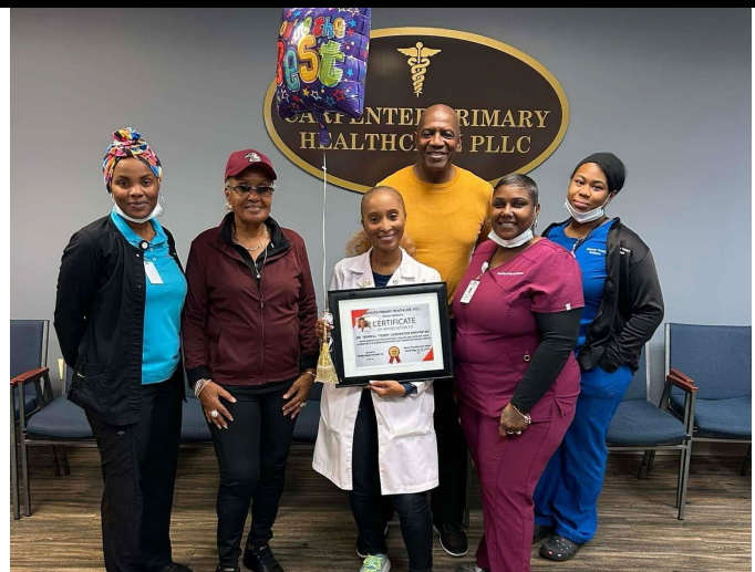
Staff recognizing Nurse Practitioners Week