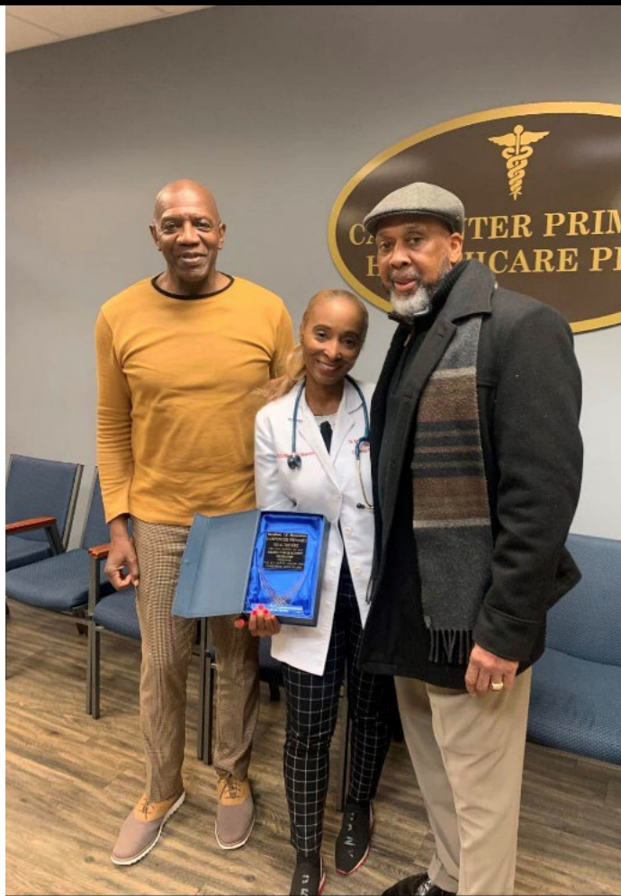
Malone Cancer Support Foundation