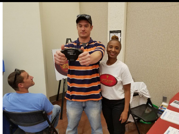
UTHSC Men's Health Summit