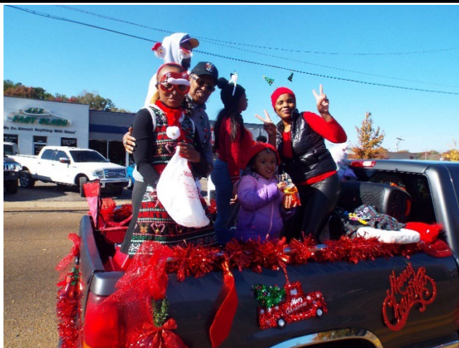
CPH Staff at the Whitehaven Christmas Parade