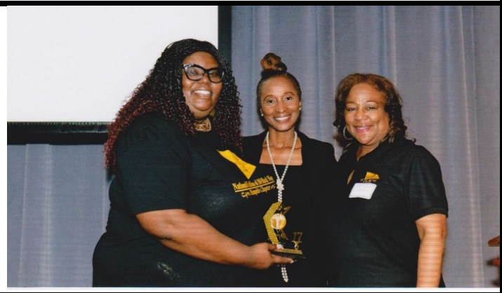
Recipient of the 2017 National Coalition of the 100 Black Women-Memphis Outstanding Service in the Field of Healthcare Award