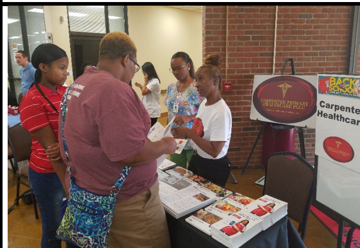
Back to School Community Health Fair