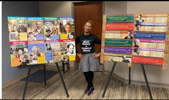
Black History Month