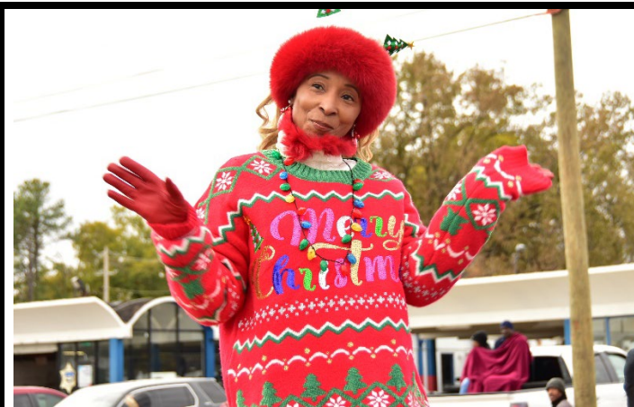
Whitehaven Christmas Parade