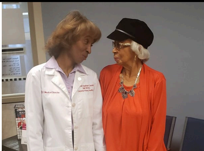
Beloved Patient – (now deceased)