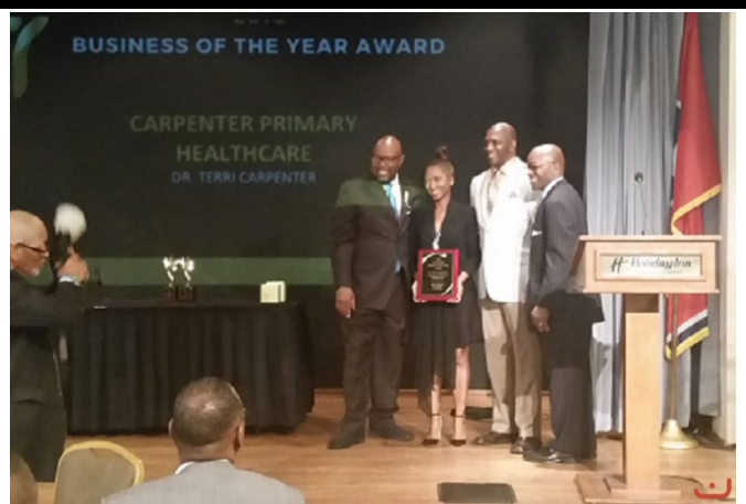
2016 Black Business Association Memphis Minority Business of the Year Award