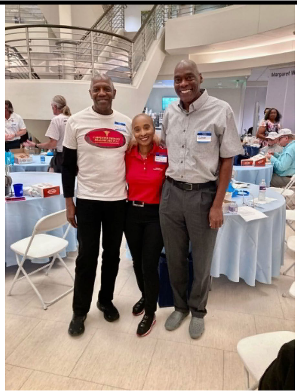
Man2Man Health Fair at the West Cancer Center