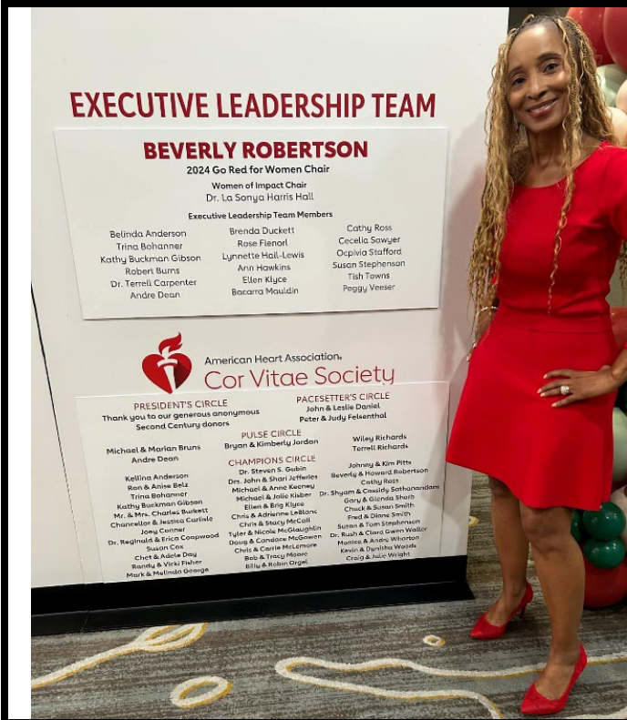
Go Red for Women