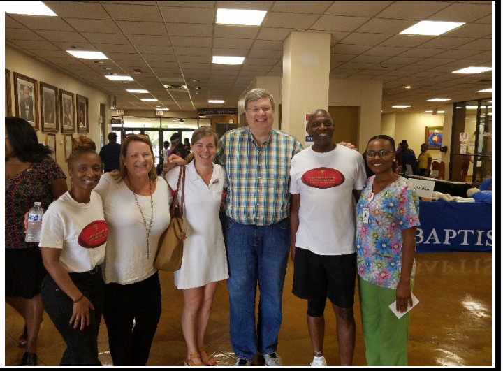
Back to school Health Fair