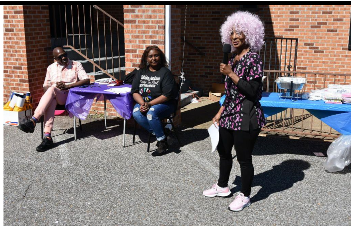
7th Annual Bobby Jackson Pretty in Pink Cancer Awareness Event