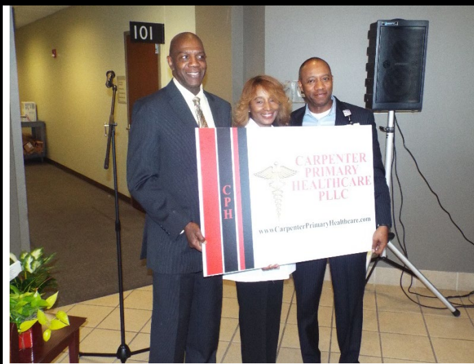
Grand Opening with Methodist South CEO