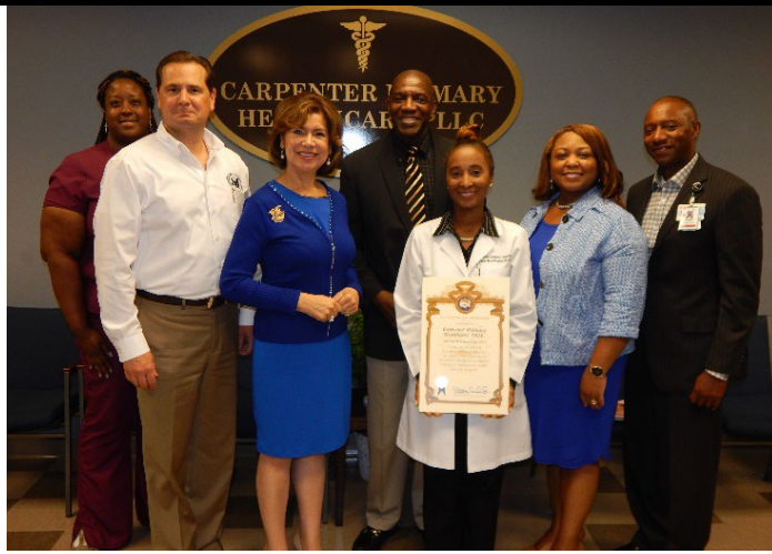
2016 USSBA Inspiring Entrepreneurial Spirit Award