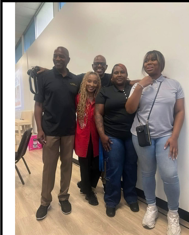
CPH staff at Prostate Cancer Symposium