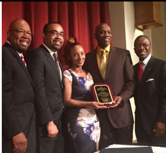
2015 Outstanding New Business of the Year Award