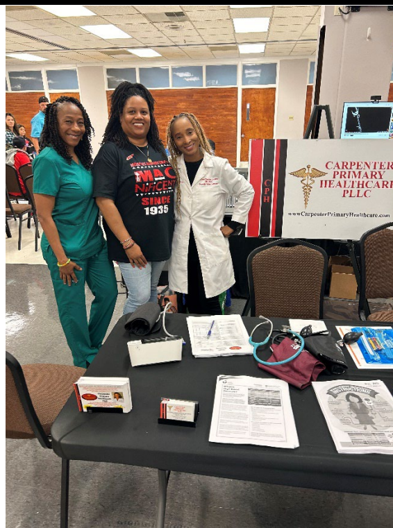
Health Fair at The BLVD