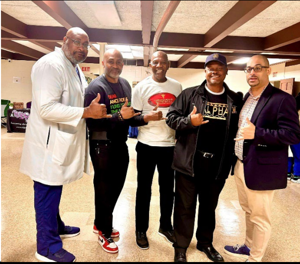
Abyssinian Missionary Baptist Church Health Fair