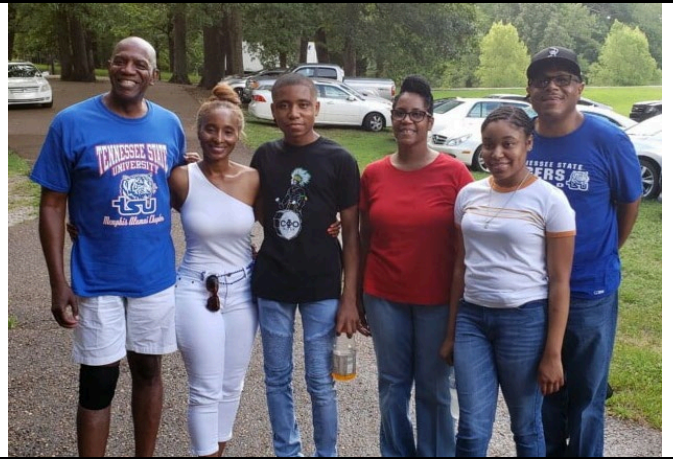
TSU-CPH Scholarship Recipient