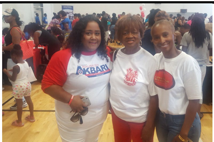
Back to School Community Health Fair