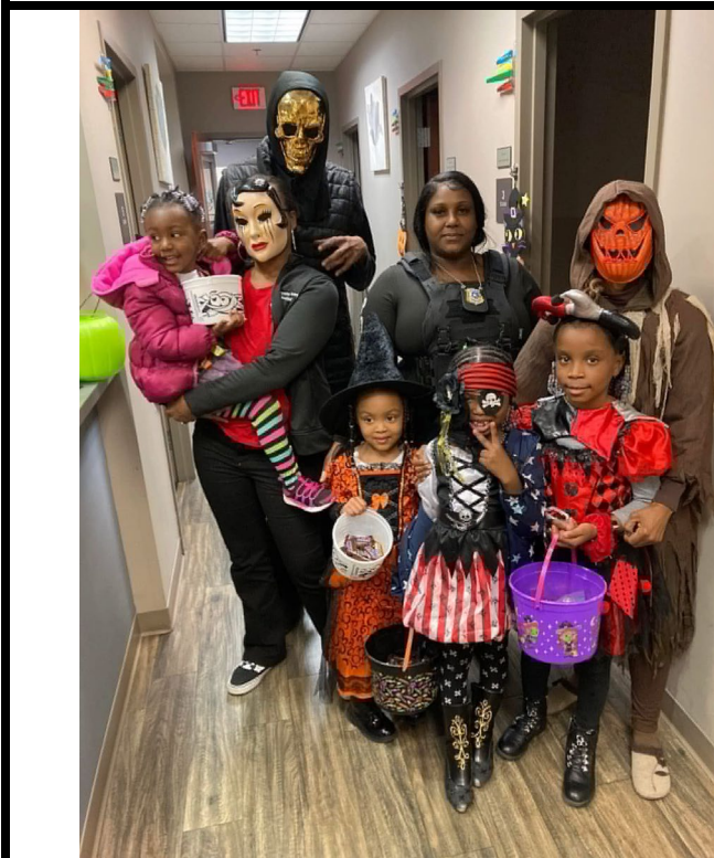
CPH Halloween with Methodist South Rehab Kids