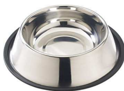
Non-tip stainless steel bowl

Water should always be available, except if you are still house breaking; then follow the rules in the house breaking section. Golden love to play in their water bowls and buckets (they like to stick their feet in it and dig in the water). Indoor bowls should be placed where it would be easy to clean up if spilled. Outdoor buckets should be attached to something like fencing to keep it from getting knocked over. This is especially important during the hot summer months when dogs need lots of water.