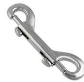
Double-ended snap hook