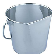
Flat-sided stainless steel pail for outside