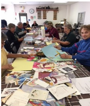
Charity Placemats and Quilts

The second week of November is the traditional celebration of Thanksgiving at Duck Island for the Gold Nugget Sams chapter, and this year was no different. There was much fun, laughter, food and friendship, along with several activities available to the members. Twenty-one rigs shared good weather and good times! Competitions were held for potato peeling and turkey toss, along with time to work on a charity project of creating placemats for a local nursing home. Our annual White Elephant sale, red wagon raffle and jewelry sale yielded another $438.00, all of which will be given out to charities.