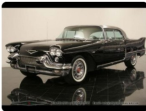
1957 Cadillac Eldorado Brougham