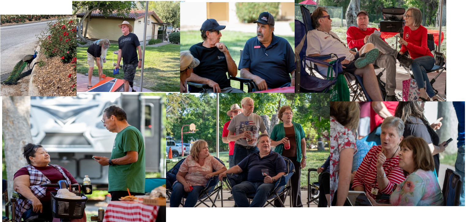
Campers just wanna have fun!