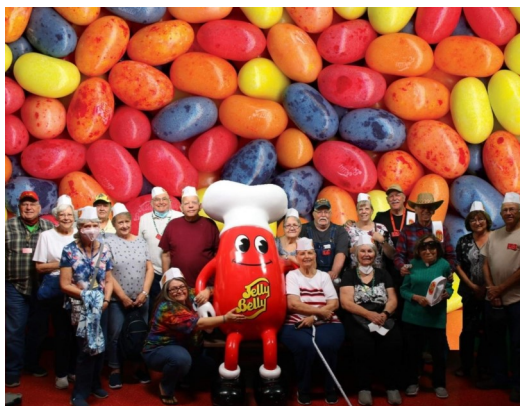
Jelly Belly Factory