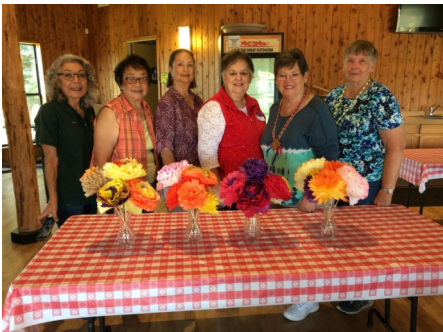
Gold Nugget Sams at Fun and Friendship