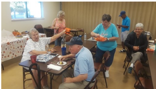
Halloween treats for everyone!

Everyone is looking forward to our last camp out of 2019 at Duck Island in Rio Vista.