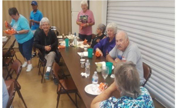
Enjoying each other's company.