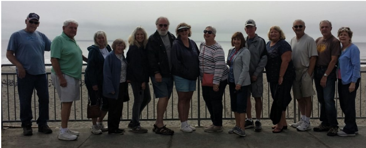
El Dorado Sams at Stinson Beach

Last but not least.....Charity summary: A total of 429 volunteer hours benefitting as many as 10 organizations have been reported for the months of June through September 2019.