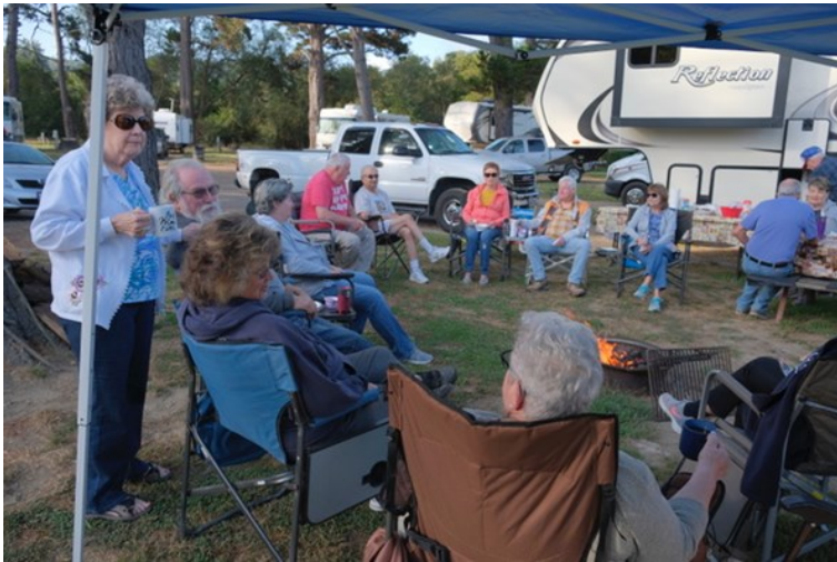
Morning campfire at Olema