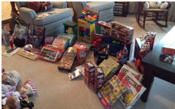
Toys collected for the Gridley Camp Fire Relief Group