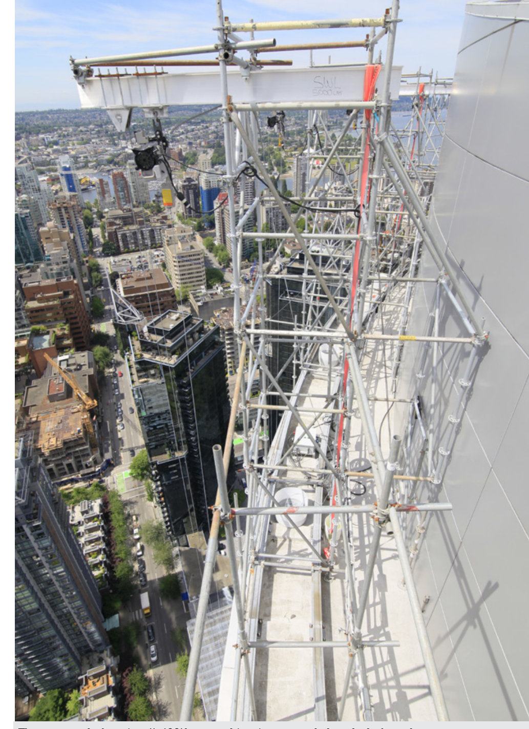
The custom platform is a 4'x400' long, multi-point suspended work platform that weighs 18,368 lbs.

The timing of the work on the One Wall project needed to happen between Vancouver's windy seasons. The Matakana team felt the key to winning the contract was being able to provide complete 360° access to each floor, at a