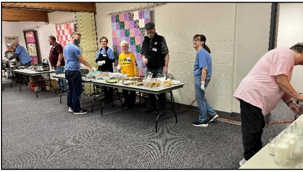
A different angle and others of the crew

Our next scheduled Neighbors' Table is Thursday, April 30, 2026.