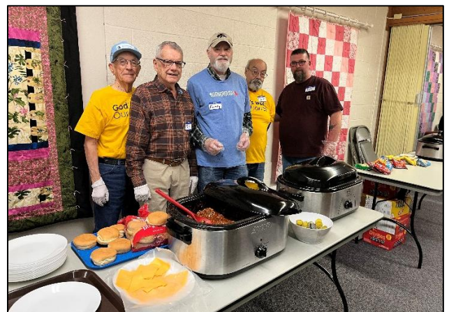
The motley part of the crew

The Neighbors' Table served 127 meals on Thursday, March 26. A couple of photos of our many volunteers are shown below.