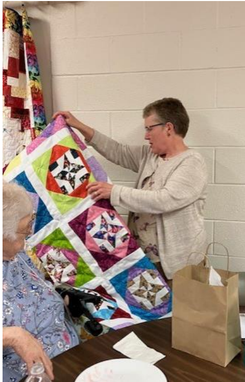
The DUO ladies presented pastor with one of their beautiful quilts at a luncheon in her honor.

DUO will meet at the church on Tuesday, July 22 and again on Tuesday, July 29 from 9:30 am – 1:30 pm. Come help tie or pin quilts together. Bring your lunch!