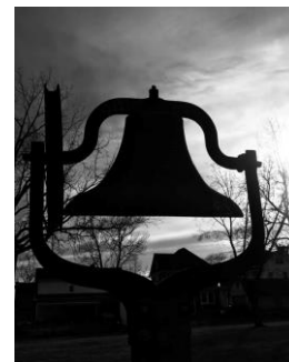
Bell at the Seneca Falls Historical Society