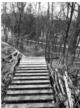
Pinnacle Hill in Rochester, NY