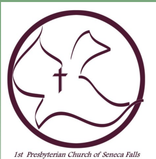
1st Presbyterian Church of Seneca Falls