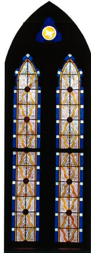
Dove Window Holy Spirit