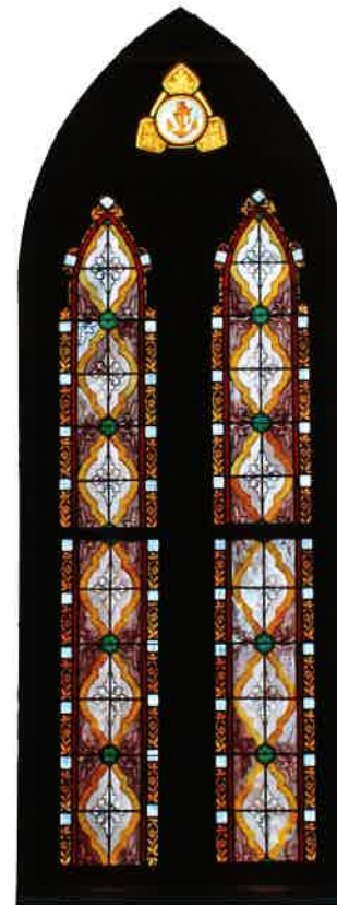
Anchor Window Hope, Christian Seal, Cross