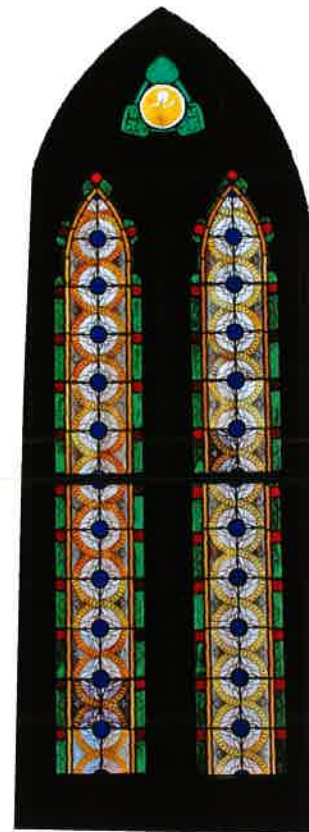
Lilly Window Symbolizes Purity