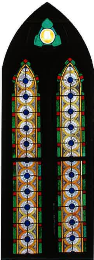
Tablets Window The Ten Commandments