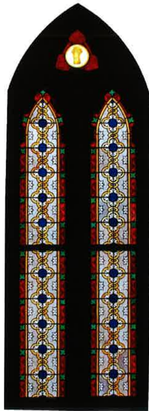
Wheat Window Bountifulness, Thanks- giving