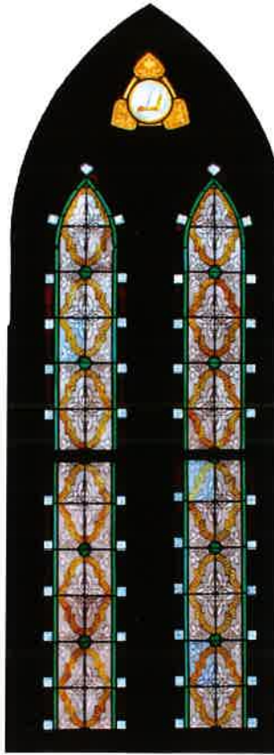
Book Window The Bible