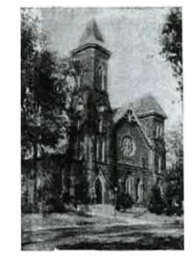
"Third" Church at current location 1871