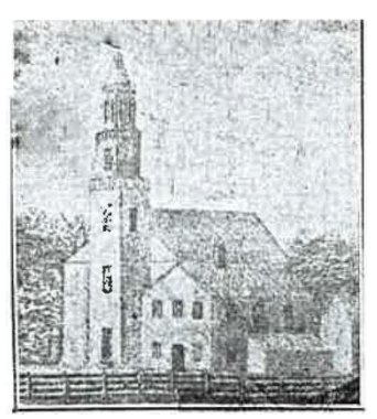
"First" Church at current location 1817