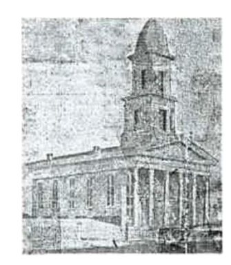
"Second" Church at current location 1842