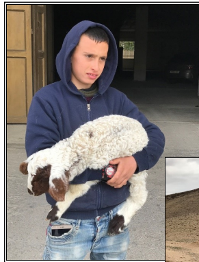
Shepherd and his flock