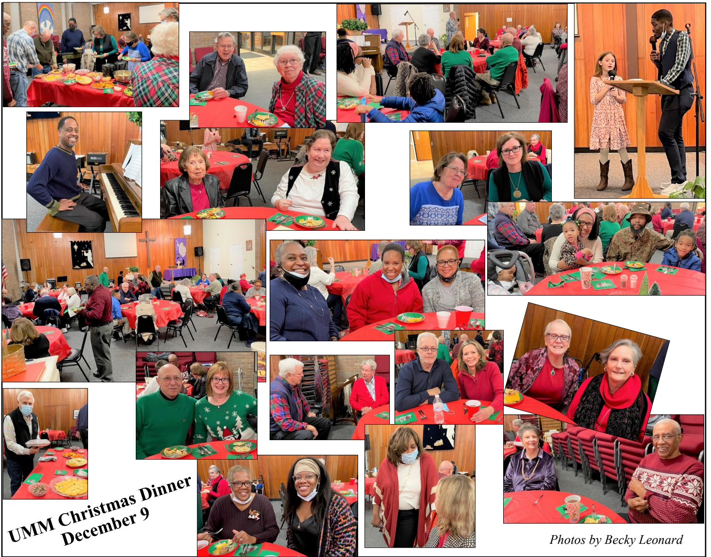
UMM Christmas Dinner December 9