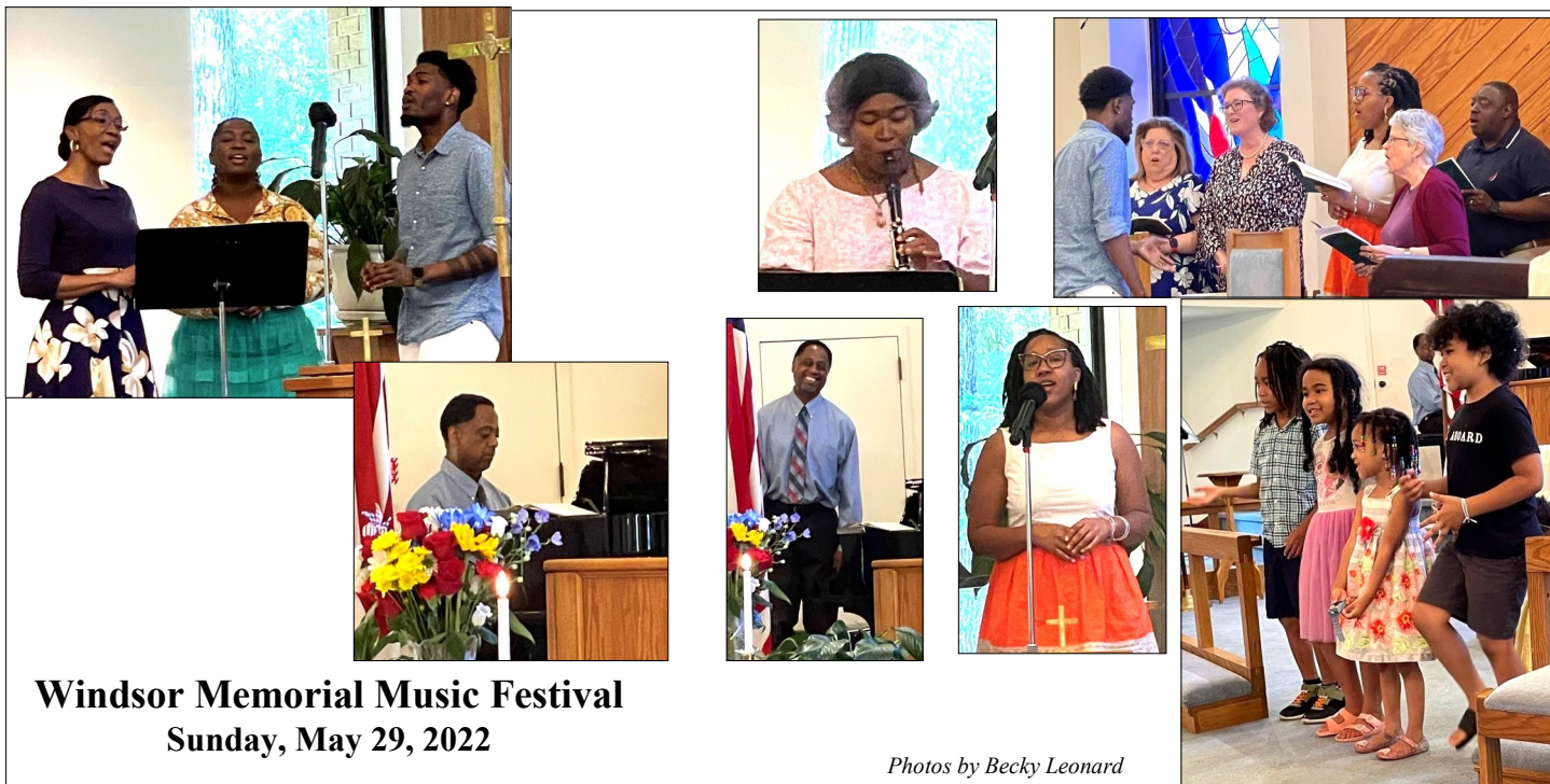
Windsor Memorial Music Festival Sunday, May 29, 2022