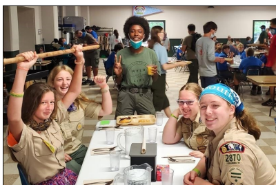
Troop 2870 won the spirit stick at Camp Barstow Summer Camp

Troop 2870 started the fall with a fun trip to Sesquicentennial State Park at the end of August to canoe, hike, lounge in the splash pad, and watch movies by the campfire.