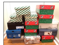
Filled shoeboxes

Many thanks to everyone who participated in this year's Operation Christmas Child, either by filling a traditional shoebox, building one online or donating funds so that we could provide more. Altogether, Windsor UMC provided 32 shoebox gifts for children in the US and around the world!