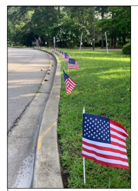
God Bless America!

Please Pray for: Our Military, Law Enforcement Members, First Responders, Healthcare Workers and their families. The people of Ukraine