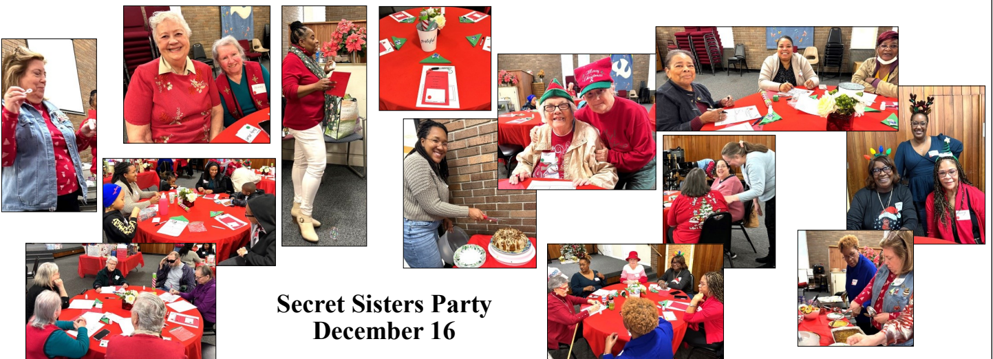
Secret Sisters Party December 16