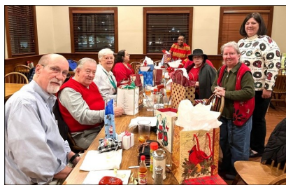
LRE Christmas Party