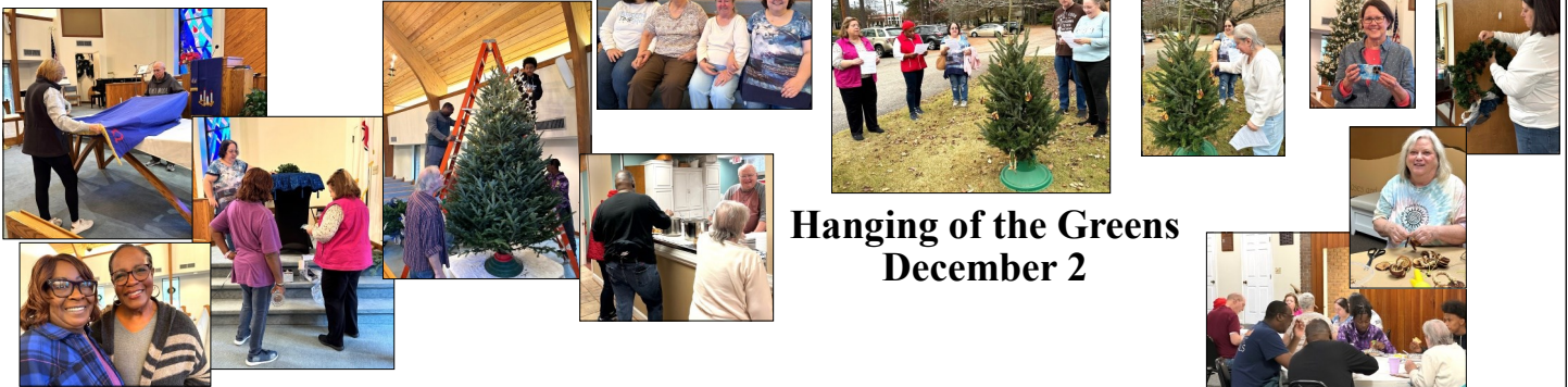
Hanging of the Greens December 2