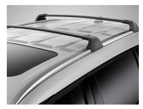
Roof rack cross bars<sup>44</sup>

This is a great way to add extra personality to your Highlander. Not every accessory is available in your area, so for a complete list of accessories, go to toyota.com/highlander/accessories.