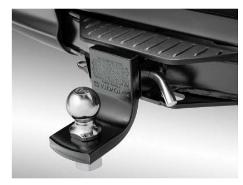
Trailer ball and ball mount<sup>2</sup>