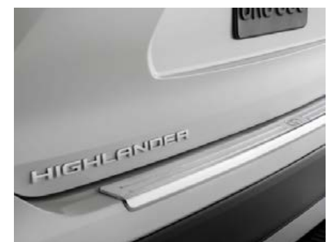
Rear bumper protector