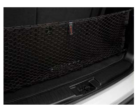
Cargo net — envelope<sup>5</sup>