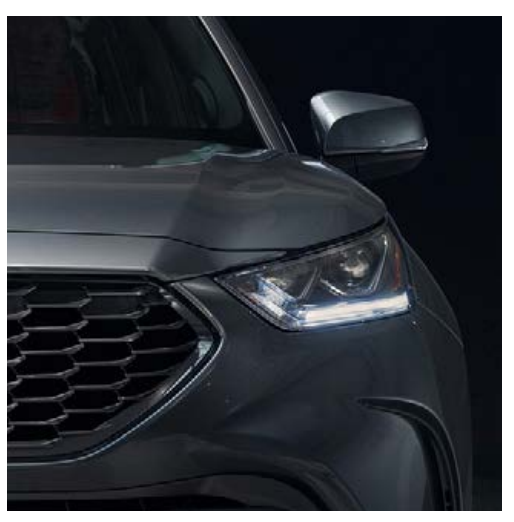
See numbered footnotes in Disclosures section.