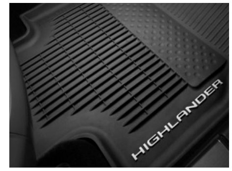
All-weather floor liner<sup>45</sup>