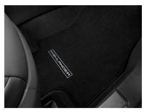
Carpet floor mats<sup>45</sup>