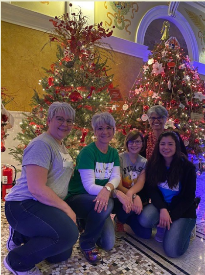
Decorated by the Brown County Area Republican Women