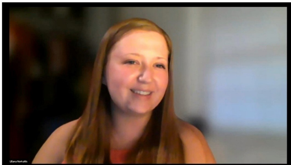
Empower Hour with NFRW Youth Outreach Committee