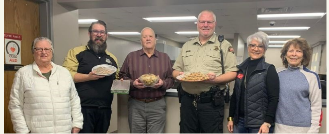
Brown County Area Republican Women Pictures Continued from pg. 3