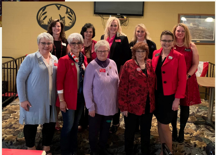
Spink County April 2022

If there are other Lincoln Day Dinner photos of SDFRW, please send them into be featured also.