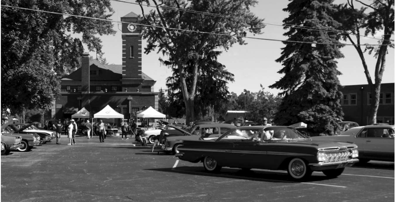
Above: Some of the many classic cars at the show August 5, 2017