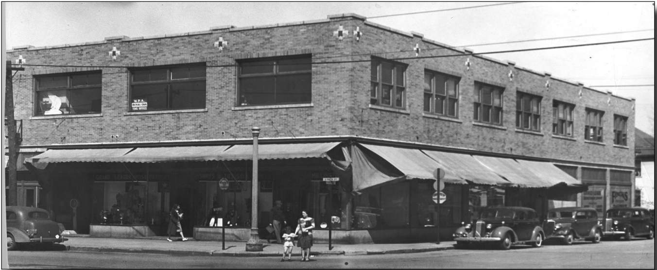
“Then”: Second & Main, Grand Leader Department Store, May 1940