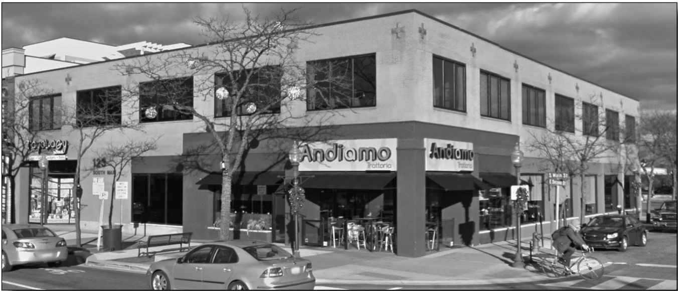
“Now”: Second & Main, Andiamo's Restaurant, September 2017

This edition of Royal Oak Then & Now looks at the northeast corner of Main Street and East Second Street. The “Then” photo is from May 1940, when the building was occupied by the Grand Leader Department Store on the first floor. The Grand Leader was the “go to” store in Royal Oak for clothing for men, women, and children. You can also see that the WPA (renamed from the Works Progress Administration to the Works Projects Administration in 1939) occupies the second floor. The WPA would be disbanded in 1943 due to