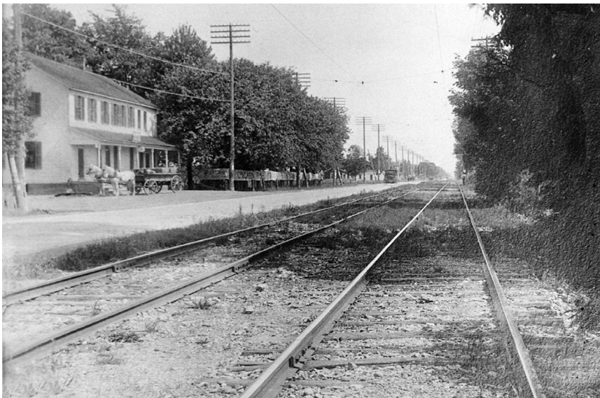
Woodward Avenue before the railroad tracks were moved to downtown Royal Oak.