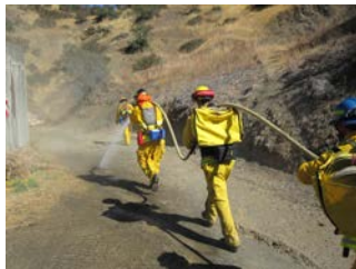
Wildland Fire Hose Lay