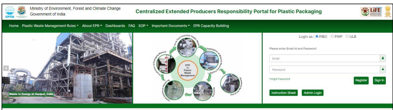
Figure: 1.1: Login in EPR portal