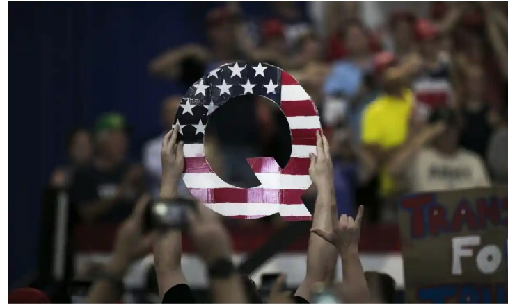
The elected candidates would be in prime position to overturn election results as they fit.

As part of a calculated assault on democracy, QAnon steered far-right candidates toward secretary of state contests