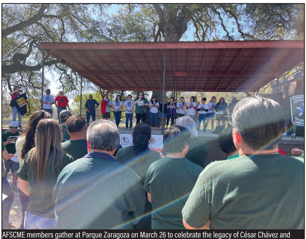
hear the announcement of Local 1624's "$22 in '22" living wage campaign.

This month, Local 1624 was featured on the AFSCME International blog for winning the fight to increase the City of Austin's living wage from $15 to $20 per hour.