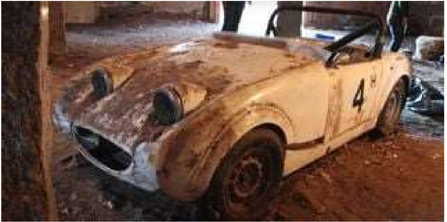
Restorer Saves 1960 Austin-Healey Bugeye Sprite From The Junkyard