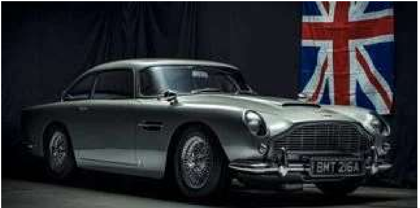
The Aston Martin DB5 Is Still The Coolest James Bond Car Nearly Sixty Years On