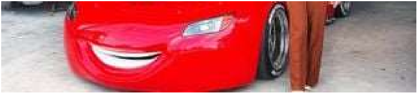
Cleanest And Most Impressive Lightning McQueen Build Spotted In Thailand