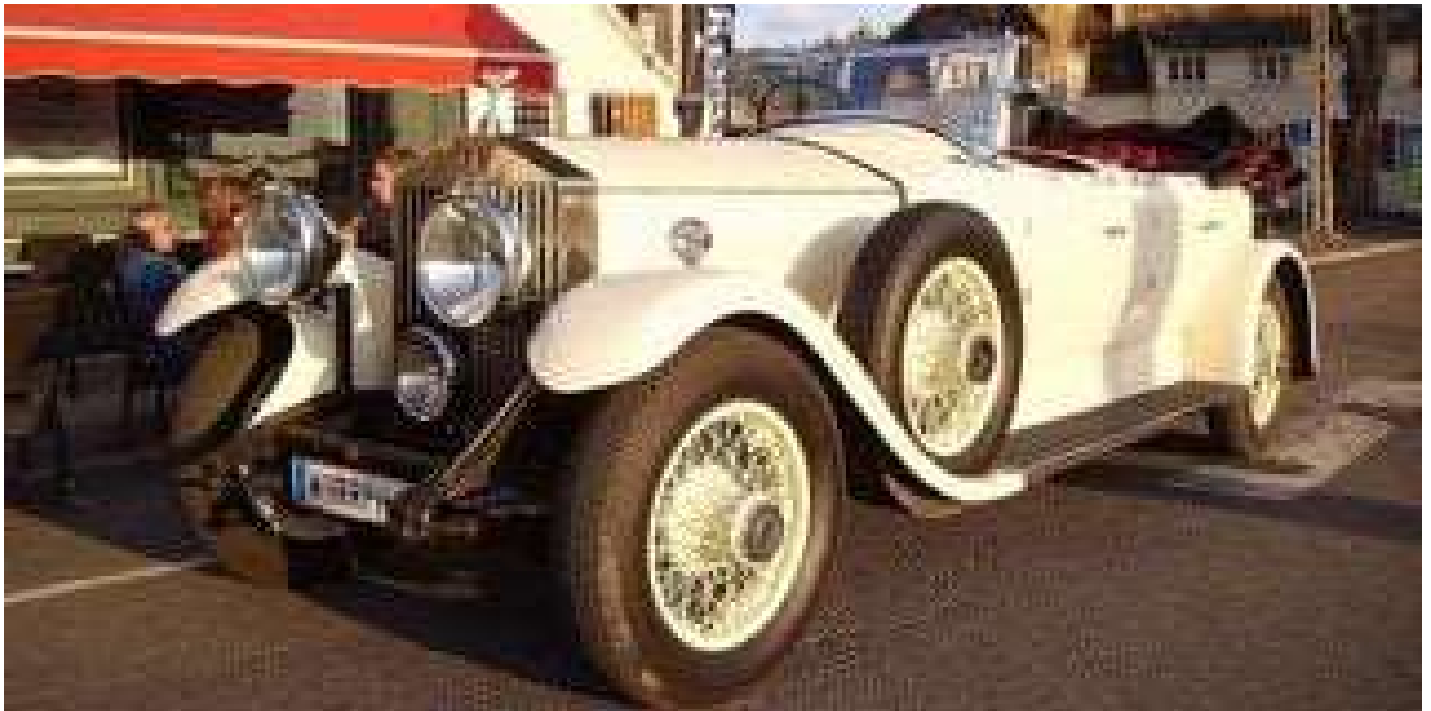
These Were The World's Top Car Brands In The 1920s