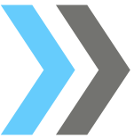
Figure out who's who.

Next time you're with some friends—maybe friends who you would expect to refer you, but haven't—simply ask them how they feel about giving out referrals in general. This is good dinner conversation, and you'll learn a lot about what scares them about referring. Later, you can turn the discussion toward helping them overcome some of those fears.