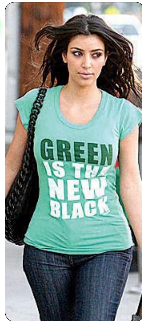
If Kim Kardashian can get her green on, so can you!