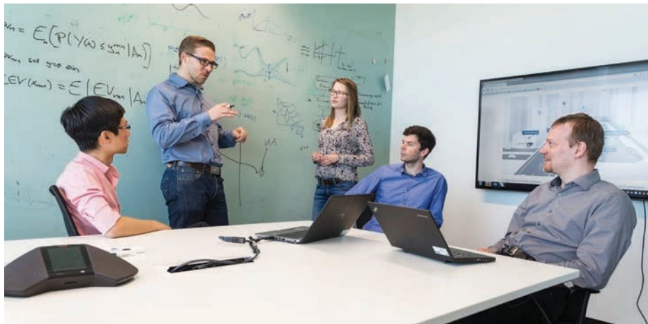
Robert Bosch associates research machine learning at supplier's Center for Artificial Intelligence in Renningen, Germany. Bosch topped the list of the world's biggest suppliers.

Adient (No. 11): The spun-off seat business of Johnson Controls, Adient intends to zero in on seating, separating itself from the distractions of interiors and JCI's other historic automotive mainstay, batteries. The seat maker now has launched Adient Aerospace, a joint venture with Boeing to develop and produce