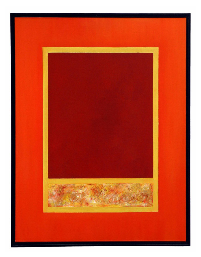
Fig. 2-11 Adis Soriano - En Movimiento, 11 - Oil on canvas, 100 x 80, 2007