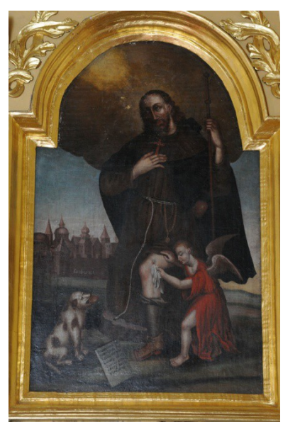
Fig. 2-5. Kaszewy, parish church, St Roch, 17th century.

There is a wide group of preserved paintings of St Roch. They date from the seventeenth and eighteenth centuries, but, more importantly, some paintings were commissioned in the nineteenth and twentieth centuries. Documented historical material proves that this patron saint was exceptionally popular. Among those depictions, we can mention a painting from a finial of a side altar in Bąków Górny and in Bielawa, from a side altar in Kaszewy from the seventeenth century [Fig.5] and in Złaków Kościelny. St Valentine from Łęki Kościelne is an interesting example of an eighteenth century composition.