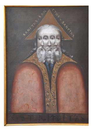
Fig. 2-6. Allegory of the Holy Trinity, Skomlin, 1776, parish church; The Holy Trinity, a procession float, Boczki Chełmońskie, 1768, Old Church of St Roch in Boczki Chełmońskie

In Skomlin church, the depiction is an element of the scenes presenting the life of St Philip – it illustrates a conversation between St Philip and Jesus, which can be called "the Mystery of the Holy Trinity". St Philip appears on the pages of the Bible during the Last Supper, asking Jesus: Lord, show us the Father, and it suffices us ( J , 14:8). In reply, Jesus explained that who has seen Him has also seen the Father, because He is in Father. The depiction was provided with a couplet: