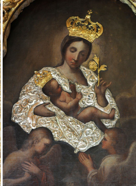
Fig. 2-2. Chruślin, parish church, the main altar, Mary with the Child, 17<sup>th</sup> century, a metal dress, Mid-18th century. (Photo Piotr Gryglewski).