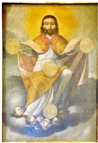
Fig. 2-7. The Holy Trinity – Christ with three Faces ; graphics from the book by Pablo Anzara (1630); Gregorio Vásquez de Arce y Ceballos, circa 1680, Museo de Arte Colonial, Bogotá, (photo E. Kubiak).