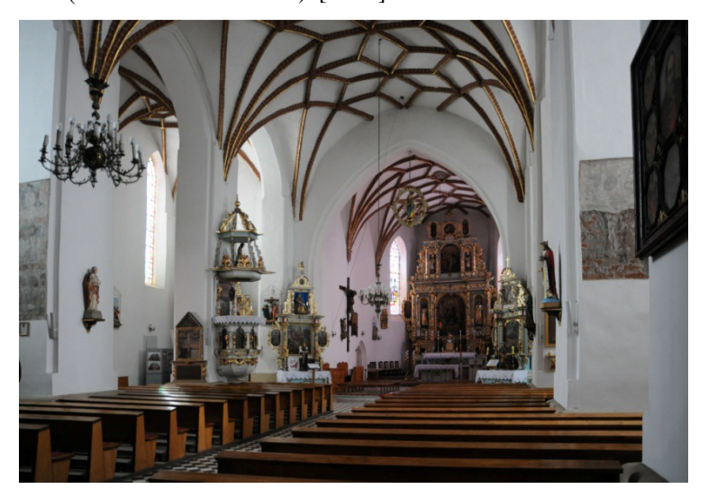
Fig. 2-1. Szadek, parish church interior.

Discussing particular church arrangements, we should pay attention to the topography of the objects. It resulted from specific liturgical needs attributed to a particular church. Those needs were determined by a church's dedication as well as by developing cults and foundations. The main altar's design usually referred to the church's dedication. However, due to Marian cult popularity, images of Saint Mary were usually highlighted, while images of saints were placed in a sliding panel or in a finial. The example could be Chruślin, where a church is dedicated to St Michael, yet it is an image of Mary with the Child, which was venerated and thus covered with a so-called "dress" and metal applications. Similarly, in Złaków a church is dedicated to All Saints, but a picture of Mary is highlighted in the main altar. The theme of paintings was influenced by a local tradition and the popularity of particular saints. Here, the most popular one was St Roch, and the second place belonged probably to St Valentine.