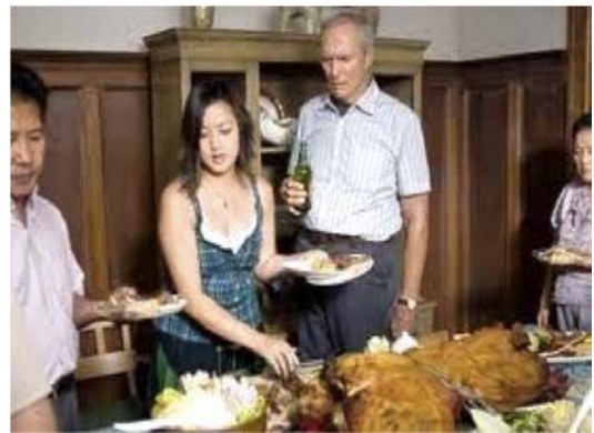
Fig. 1-5 and Fig. 1-6 Food as a tool to create a sense of community