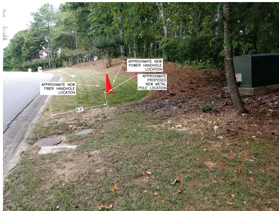
2 PROPOSED POLE LOCATION NOT TO SCALE