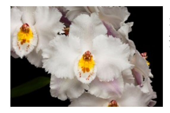
Robert B. Dugger Award – Oncidium alexandrae 'Cream' AM/82, exhibitor New Vision Orchids, submitted by Cincinnati JC