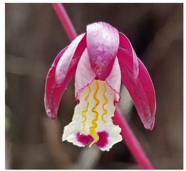
Texas Purple Spike, showing the contrasting colors and the vivid yellow "stripes" on the lip, which can go from three (left) to one (right).

While the two Hexalectris orchids tended to be short in stature, the same was not true for the Arizona Crested Coral Root ( Hexalectris arizonica ). The spikes were quite thick in diameter and very robust. Most of the spikes had flowers that were somewhat closed - they tended to be self-pollinating as well, but every now and then, there would be an open flower, and they resemble the Crested Coral Root ( Hexalectris spicata ).