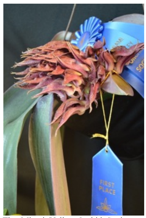
June Award for Miscellaneous Species to Bulb. spiesii, owned by Oakwood Orchids.