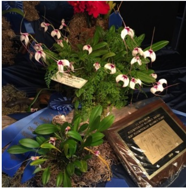
F L Stevenson Award for Best Pleurothallid awarded to Masd . Marinrod 'Marsh Hollow' HCC/AOS owned by New Vision Orchids, Yorktown, IN.

The Miami Valley Orchid Society also awarded it their Al May Pleurothallis Award.