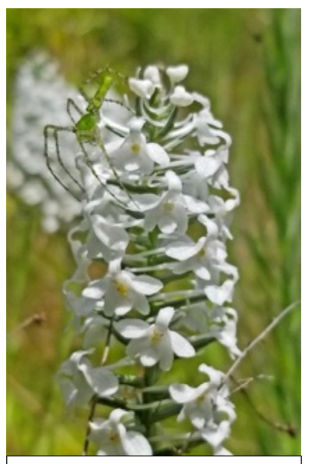
Snowy Orchid with a green spider, waiting for an unwary pollinator to pass by.

bloom unfurling - a Grass Pink Orchid that did not receive the memo (see above right).