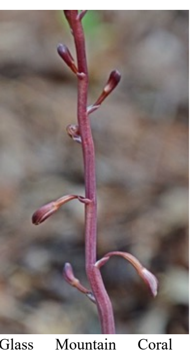
Glass Mountain (Hexalectris nitida)