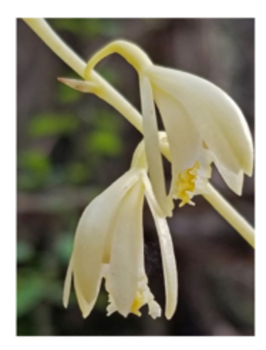
Alba form of the Texas Purple Spike ( Hexalectris warnockii ).

The three species of Hexalectris orchids blooming in the Dallas area nature preserve.