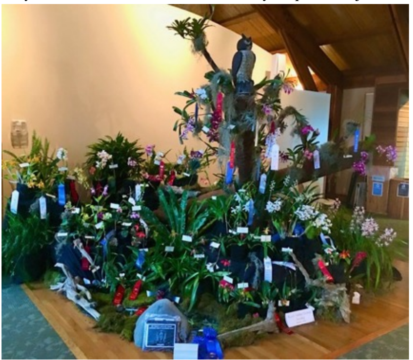
Mid-America Trophy for Most Outstanding Exhibit by an Affiliated Society awarded to the Miami Valley Orchid Society. It also received the AOS Show Trophy and an 87-point Silver Certificate.