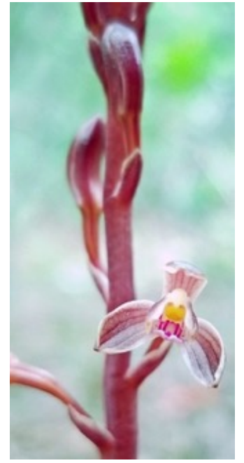
Arizona Crested Coral Root Glass (Hexalectris arizonica) (Hexa

After some time photographing plants in the area, Charles was asked to bring us to see the H. arizonica , so that we could see all three types of blooming Hexalectris orchids (Unfortunately, H. grandiflora had not bloomed for a few years in the Preserve, when they rerouted the trail to better protect the orchid, but in so doing, the habitat changed enough for the orchid to remain dormant).