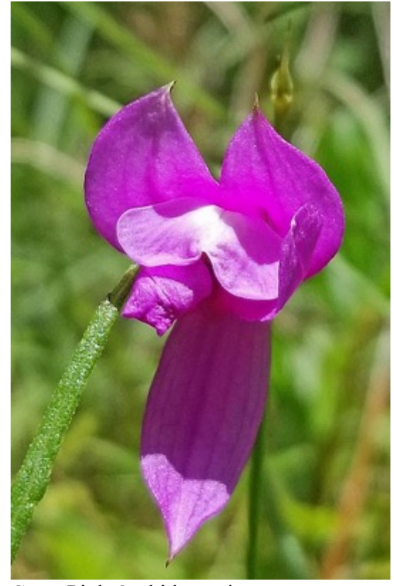
Grass Pink Orchid opening up.

I was warned that the Grass Pink Orchids (Calopogon tuberosus) would be done blooming by then. However, a short walk around the fen revealed a vivid purple bloom unfurling. a Grass Pink Orchid that did not readily