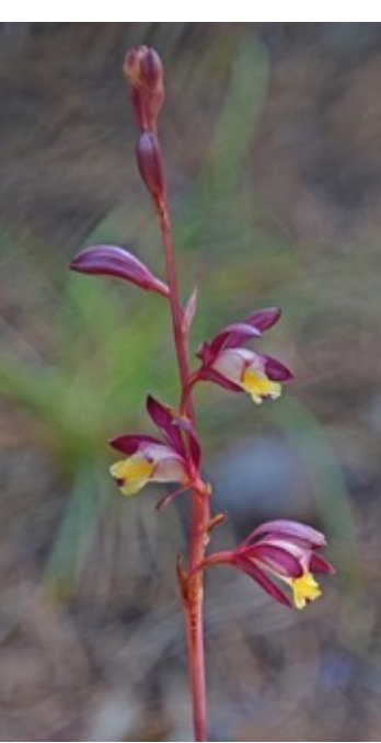
Texas Purple Spike ( Hexalectris warnockii)

The three species of Hexalectris orchids blooming in the Dallas area nature preserve.