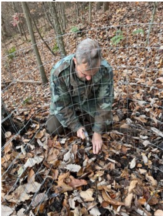
Securing the cage with tent stakes; relatively effective deer-proofing.

Once the seedlings are placed about 12 inches apart, they are marked with stakes and covered lightly with the loosened dirt, decaying leaf mold and then dry leaves in that order. The planting area is then securely caged to protect the orchids from deer predation and flagged. NOPEs members will return to these sites next spring, to check on the seedlings, monitor the light level as the forest leaves out and remove any woody invasives.