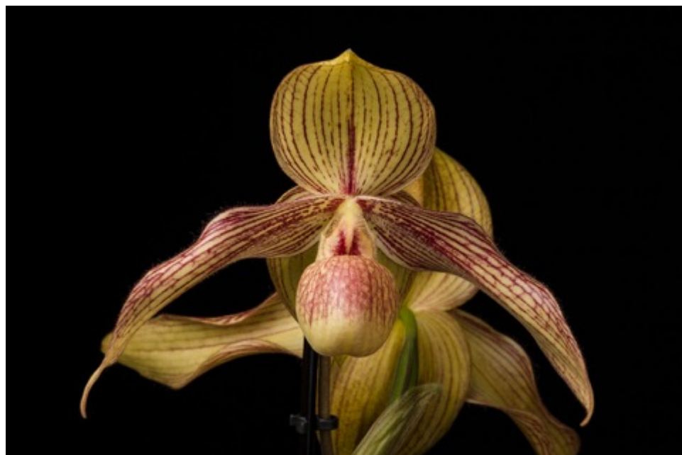
Paph Alexej 'Golden Dragon' AM Orchid Inn