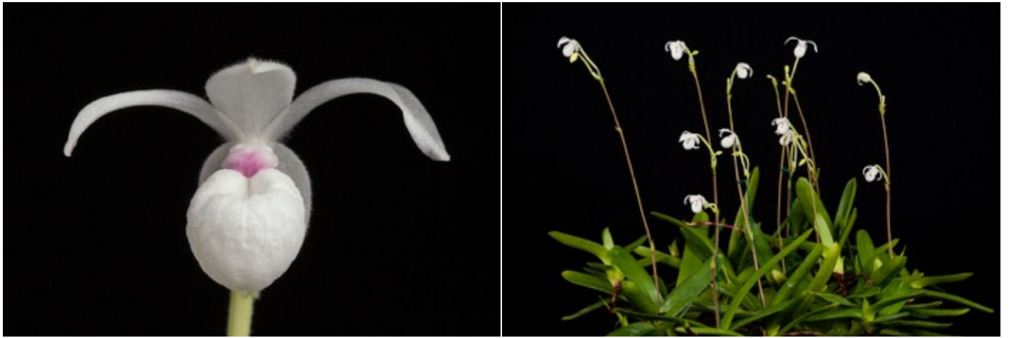
Mexipedium xerophyticum 'Pixie Slippers' AM. Marilyn LeDoux