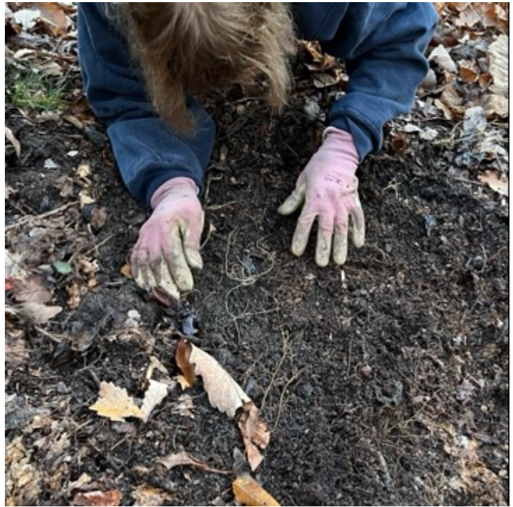
Planting the cyripedium seedlings; they were refrigerated until they could be planted. The bare ground has enough space for three seedlings.