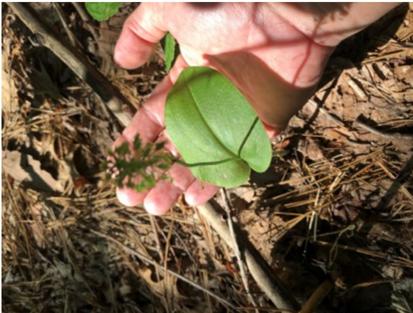
Article and Photo Credits by Ken Mettler

If you go hiking in southern Ohio in July, keep an eye out for these tiny denizens of rich woodlands. Other species of orchids have blooming seasons that overlap the Adder's Mouth Orchid, including the much more common Rattlesnake Plantain ( Goodyera pubescens ), Purple Fringeless Orchid ( Platanthera peramoena ), Three Birds Orchid ( Triphora trianthophoros ) and Crane-fly Orchid ( Tipularia discolor ).