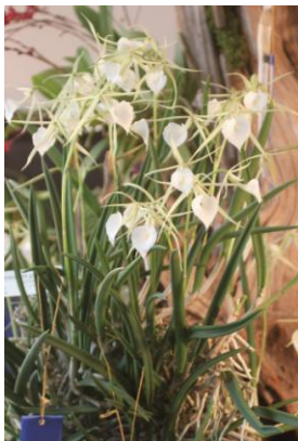
Brassavola grandiflora , Windswept in Time Orchids (Broadview Heights, OH):

Delbert Lowell Jacks Award to the best specimen plant in the show went to: