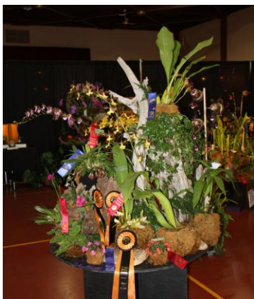
Winner of the AOS Show Trophy, a three-dimensional floor display from Marsh Hollow Orchids (Mario Ferrusi)