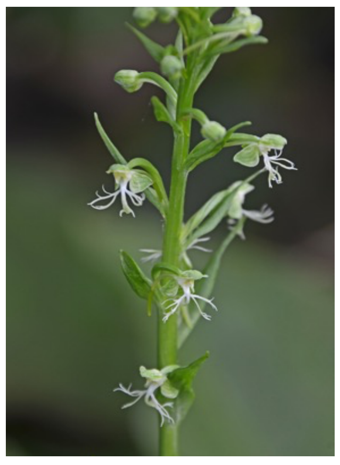
Ragged Fringed Orchid by the boardwalk