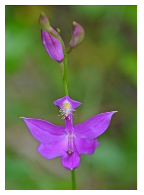
A dark and vibrant Grass Pink Orchid