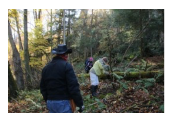
Preparing the site.