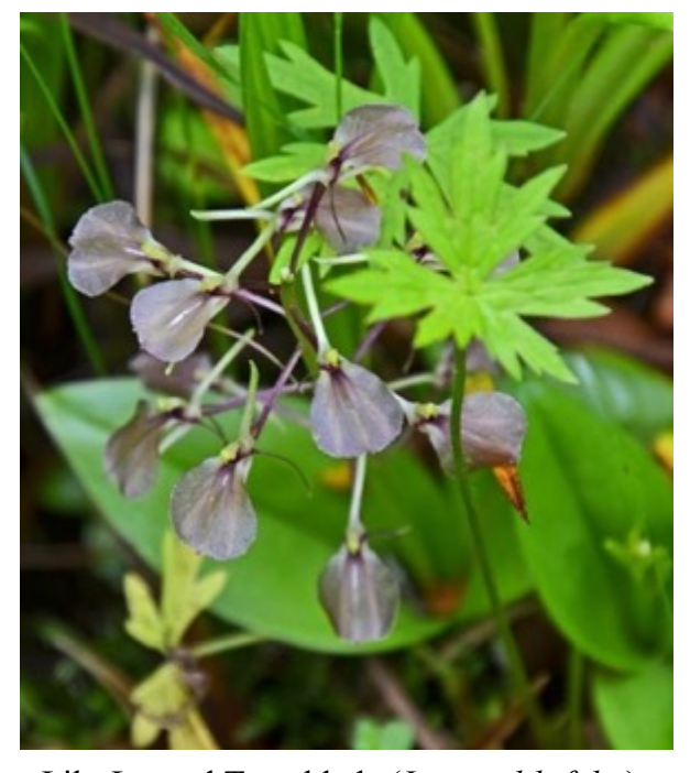
Lily-Leaved Twayblade (Liparis liliifolia)

Just off to one of the trails outside the Cranberry Glades boardwalk is another habitat rich in native orchids in bloom in June. In this damp-to-wet open field, you can find Loessl's Twayblade, the Lily-Leaved Twayblade ( Liparis liliifolia ), and the Northern Tubercled Orchid ( Platanthera flava var. herbiola ). The orchids were still not so numerous and were in spike - also delayed in blooming time. The pictures here were from last year when they were in peak bloom, and at an earlier date.