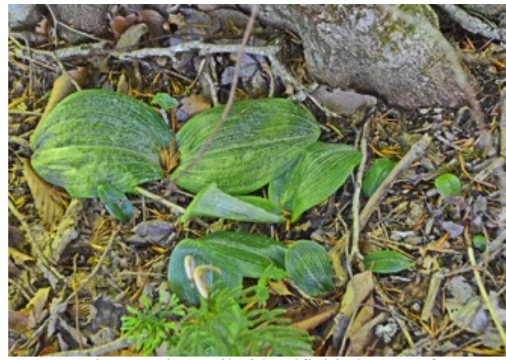
Nearby, you can also see the easily identifiable leaves of Downy Rattlesnake Plantain ( Goodyera pubescens ). I've seen them in