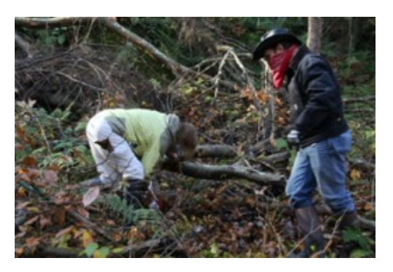
Planning the second site.