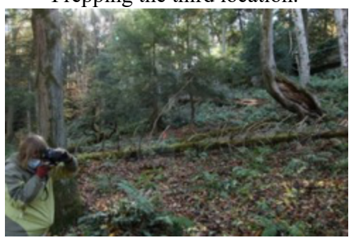
Recording our work!