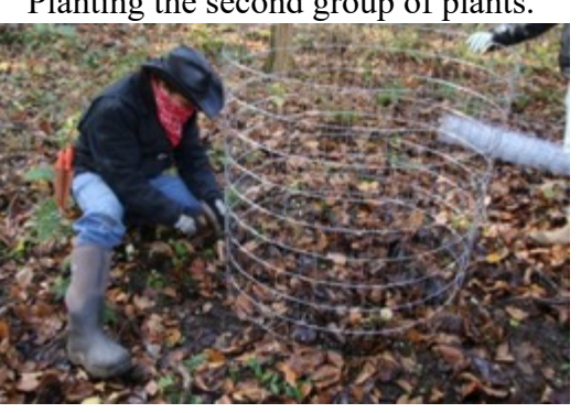
Fencing the final group.