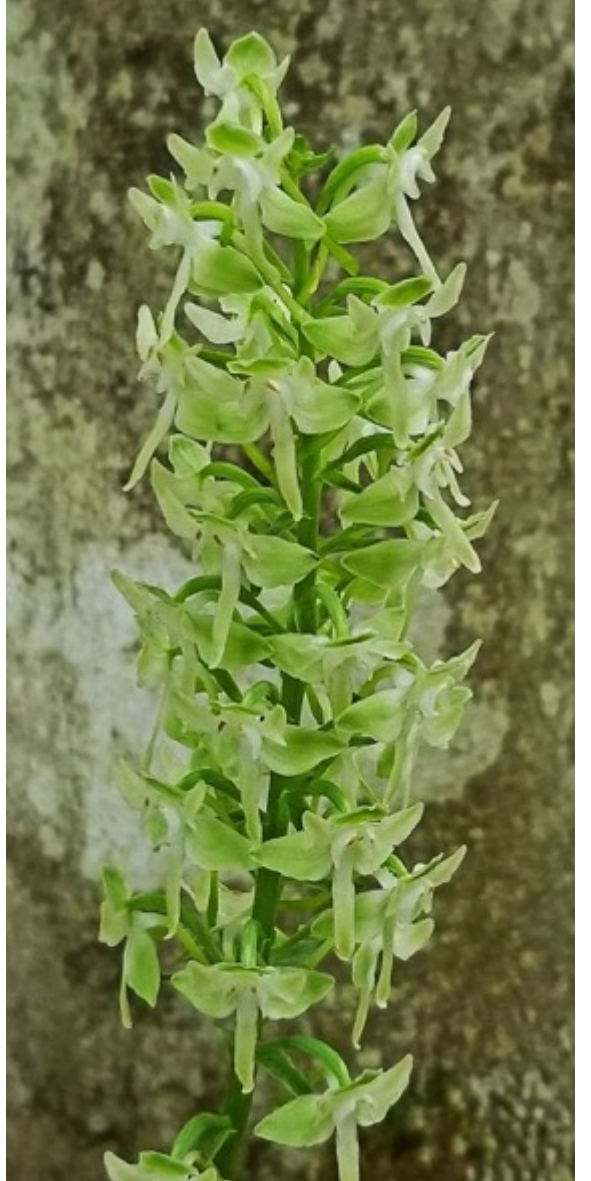
Densely-flowered spike of Pad-Leaved Orchid in 2019.

Further down the parking lot is a small population of Pad-leaved or Round-Leaved Orchids ( Platanthera orbiculata ). This year, the plants did not produce flowers, but you could see their large leaves hugging the ground (below). Last year, one of them had a very tall flower spike - a real specimen plant. Unfortunately, the late Spring frost/freeze was not something the plants liked, and none of them bore flowers this year.