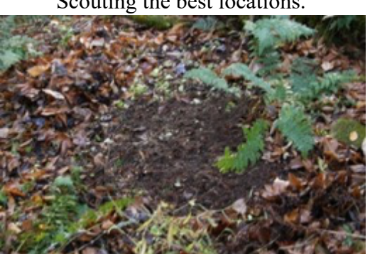
Area is ready for the plants with the topsoil loosened.