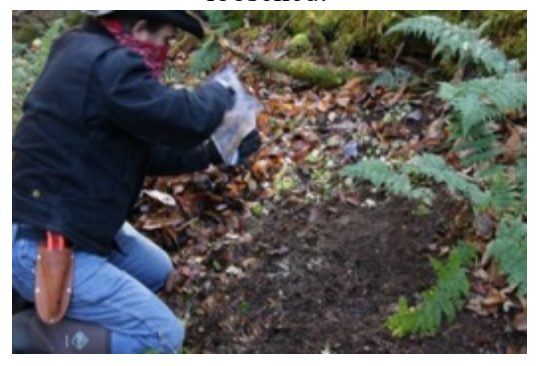
Each site gets 3 plants: 1 blooming size and 2 near blooming size.