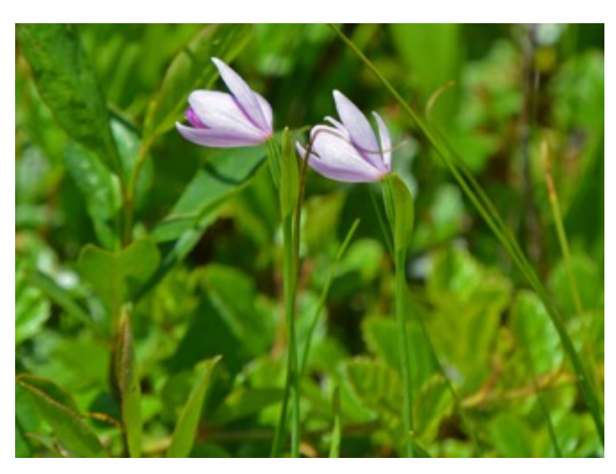
A Rose Pogonia pair close to the boardwalk.

The bog field in Cranberry Glades, in addition to the Rose Pogonia and Grass Pink orchids, also host a number of roundleaf sundews and northern pitcher plants. You can easily see the tall flowers of the northern pitcher plants, over the cranberries and orchids.