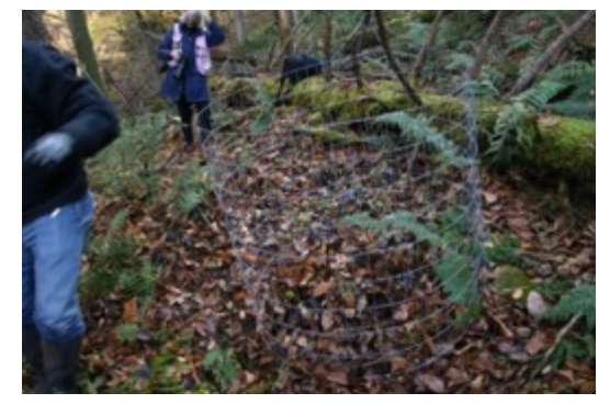
Finally adding the leaf litter and a few dead branches to encourage fungal growth.