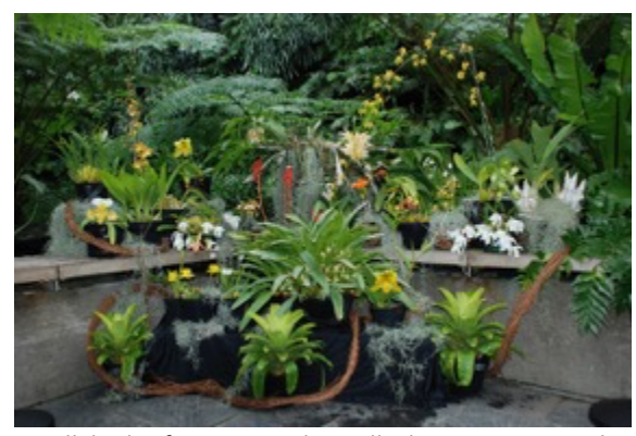
Small display for 2021, traditionally the Winter Carnival Orchid Show

We are happy to reach out to you after an unusual year. This past year's limitations on social interaction precipitated adaptations of our typically public presence in the community. We worked to keep our collections reliably accessible through social media presentations, replacing our regular Gardener Talks. Our Education Department has redeveloped the consistent favorite "Orchid Odyssey" class, and we look forward to continuing work with them to present and assess fresh programming about our collection. Working with students from the University of Minnesota Horticulture program, we began systematically cataloging our collection in a format that will allow us to more easily