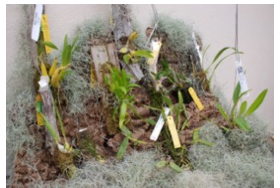
Plants newly acquired in 2020 with MAOC Conservation Committee support

With funding provided by your conservation committee, we have expanded our collection of Encyclia species,