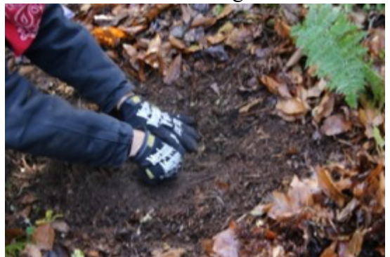
Barely covering the plants with topsoil and then leaves to cover the disturbed area so racoons don't notice and come hunting for grubs.