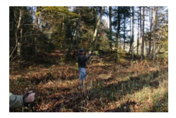
Scouting the best locations.