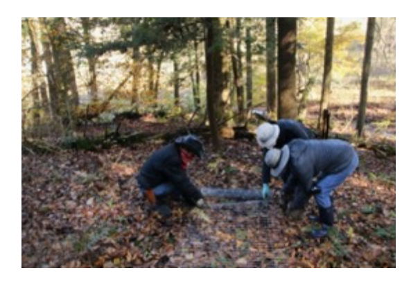
An additional precaution – fencing!