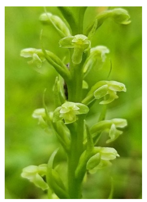
Northern Tubercled Orchid ( Platanthera flava var. herbiola )

Off in the wooded areas is another twayblade that is quite small and down to the ground - the Kidneyleaf or Small's Twayblade ( Neottia smallii ). Unfortunately, was told that this year, none of them were in bloom, not even in spike.