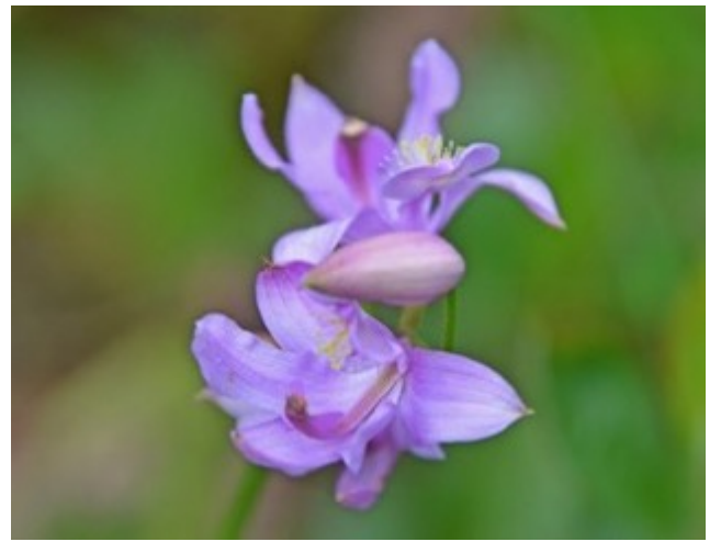
Paler color form of the Grass Pink Orchid

The Grass Pink orchids, when present in large numbers, show a fair degree of variation in hue, though I have not seen a white or alba version in the area yet.