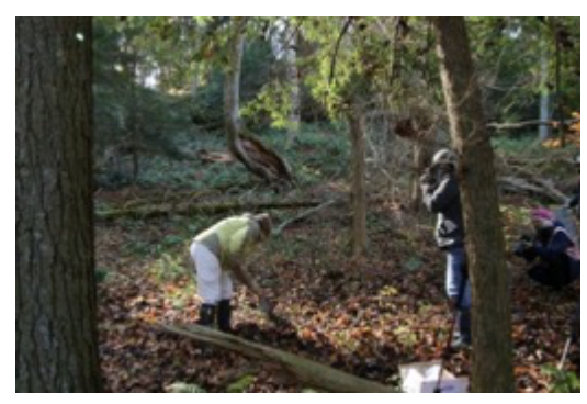
Prepping the third location.