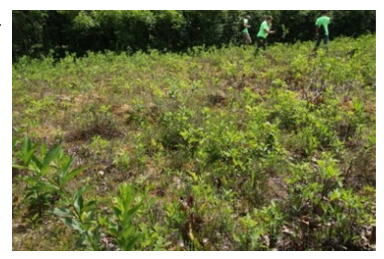
Guy Denny, ONAPA president, hacked a trail to the East Meadow, and we were pleased to see that the invasives were not as bad as along the boardwalk. There were several Grass Pinks in bloom there.