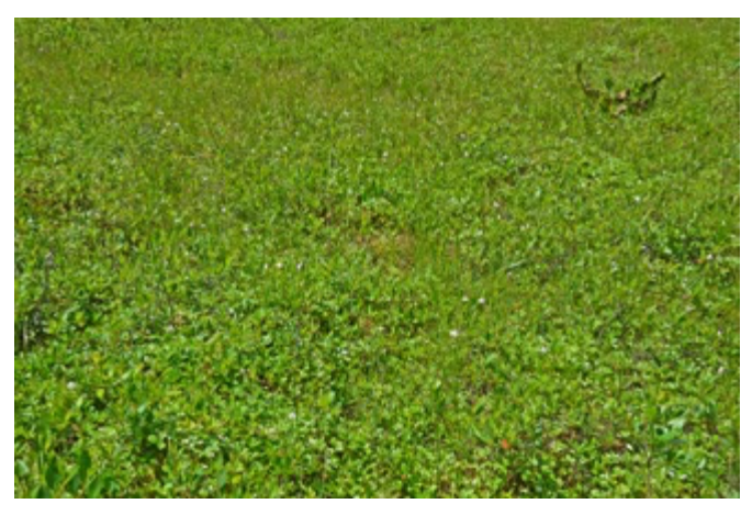
Bog field with rose pogonias

As you head to Cranberry Glades, and walk the boardwalk, you'll be treated to a large number of pink flowered orchids - Rose Pogonia ( Pogonia ophioglossoides ) and Grass Pink ( Calopogon tuberosus ). This year was a good year for them, and there were likely more than a hundred in bloom. The only thing about the Rose Pogonias is that they tend to be scattered about in the bog, with only a few near the boardwalk.