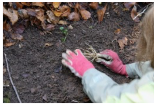
Planting the second group of plants.