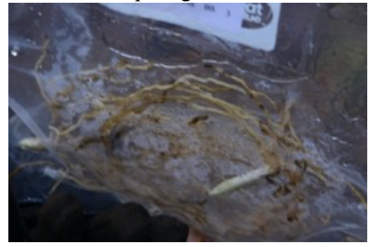
The blooming size plants have exceptional roots.