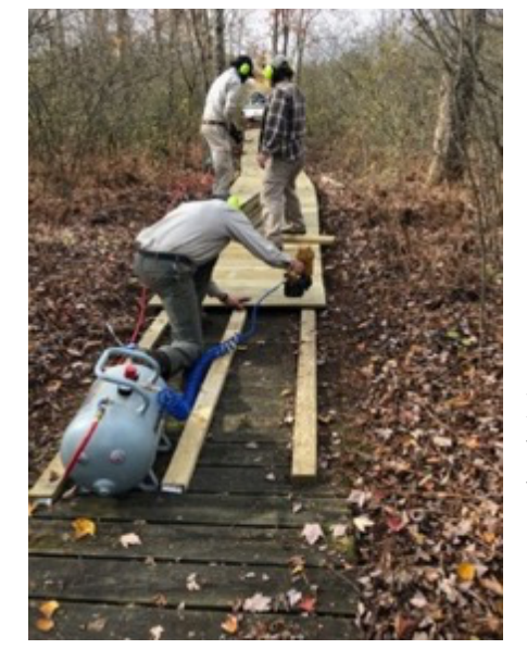
Levi Miller and other Department of Natural Resources employees started work rebuilding the boardwalk. Since the state lowers Buckeye Lake for the winter, all work is finished here until Spring!