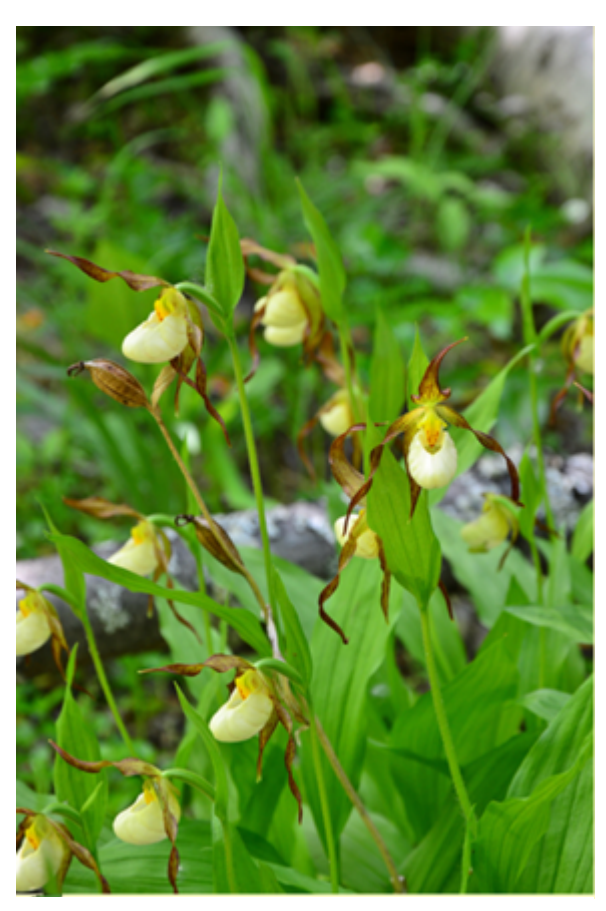
Cypripedium x columbianum, Washington.

Most of our group have not been able to see one of the parents of this hybrid Cypripedium montanum Dougl., ex Lindl., the Mountain Lady's Slipper, as it is found in western North America from California to southern Alaska at the edges of deciduous forests.