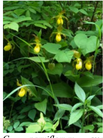
C. parviflorum var. pubescens, Ohio and not always found in a sunny environment.