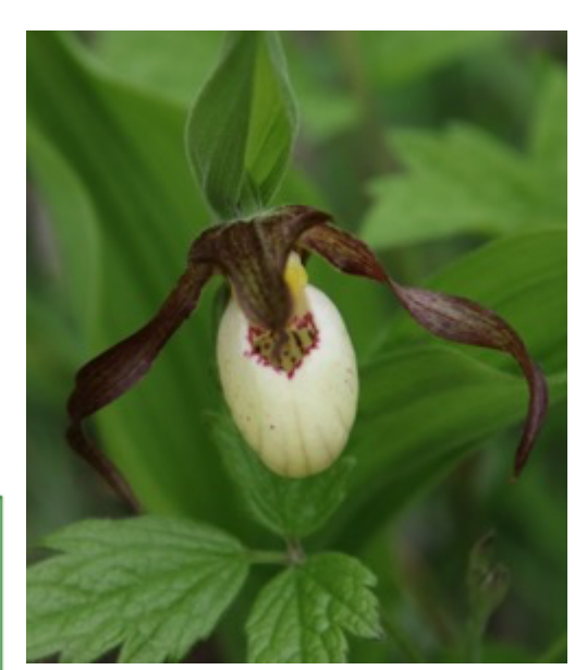
Cypipedium x andrewsii Castalia, Ohio