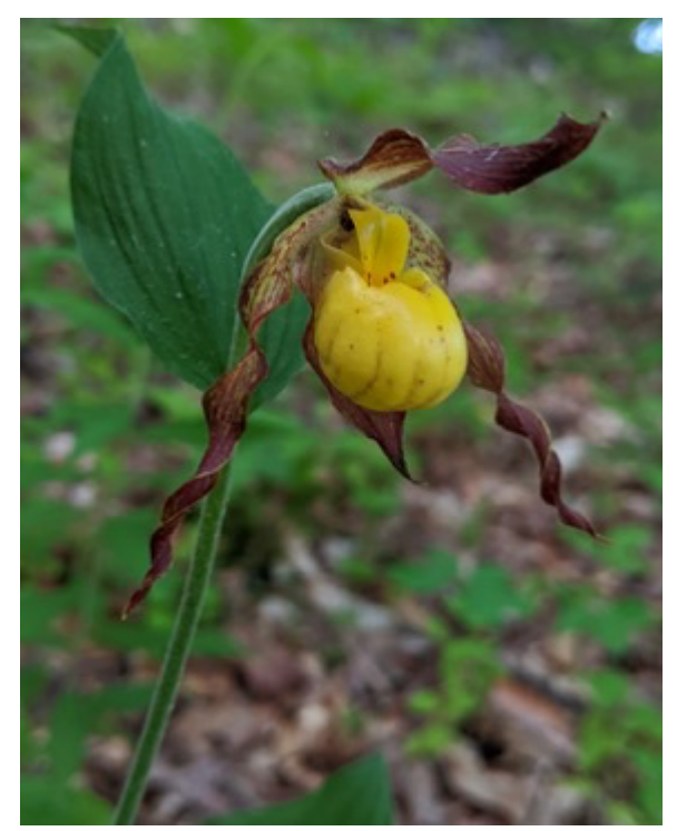
Cypripedium parviflorum parviflorum, Kentucky