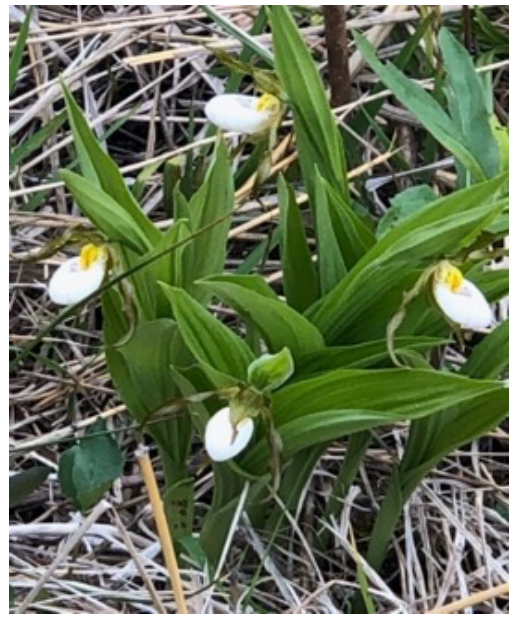
Cypripedium candidum Castalia, Ohio

The following pictures are at sites in Michigan and Ohio. The Ohio site is a sunny meadow and so far, we have only found Cypripedium candidum . along with the hybrid. Most references for the site refer to the cross being with Cypripedium makasin , but we have not to be able to find the other parent.