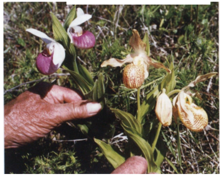
Cypripedium x herae and Cypripedium reginae, Manitoba.