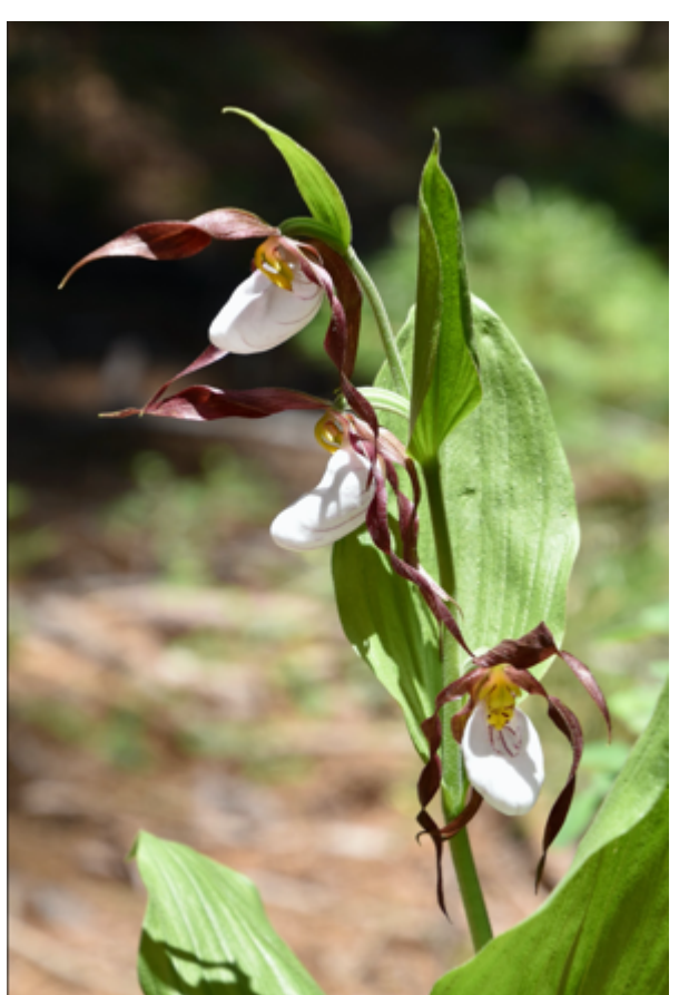
Cypripedium montanum, California