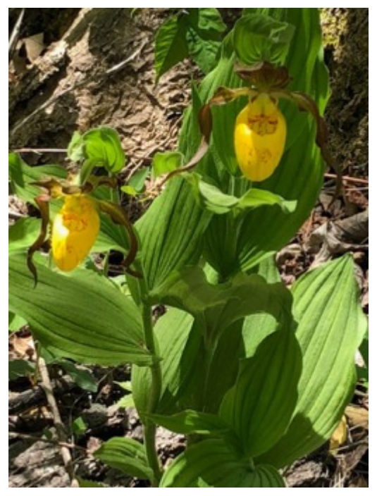
Cypripedium parviflorum var. pubescens, Ohio

Recognized throughout the world for over three hundred years as an extremely variable plant, the yellow lady's slipper has had various names over the same time period. When the exact name of a plant cannot be determined, discussion about the plant is difficult. Thus, an agreed upon name is vital. Because of the variation in Cypripedium parviflorum , people naming the plant have given it different names. The following is a short summary of how this has contributed to the naming and variation issues. I am not going to list all the names of