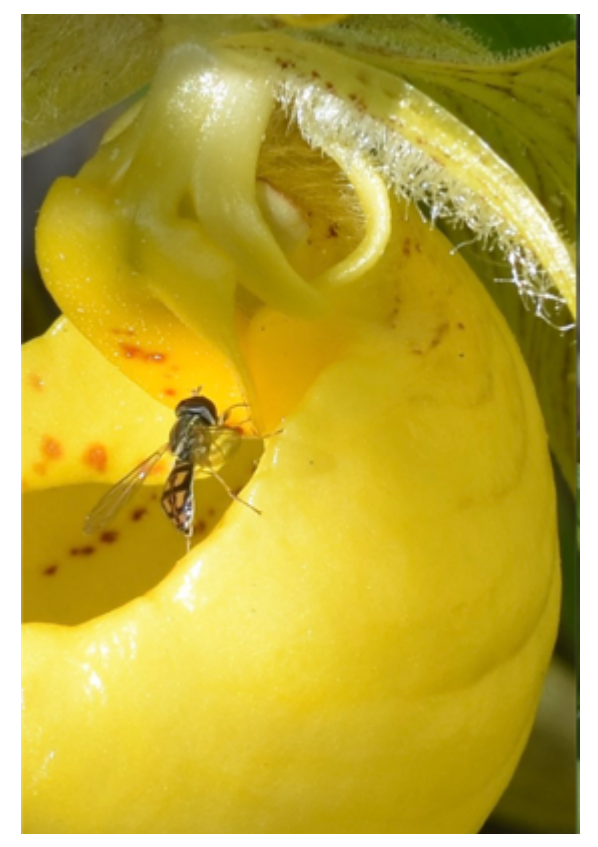
Cypripedium parviflorum var. pubescens showing one of the syrphid flies of the family Syrphidae. Also note pubescent hairs.

Mycorrhizal fungi are necessary for germination in many orchids and may be necessary in adult orchids. Some plants have specific fungal associations. Cypripedium parviflorum association is found with the Tulasnellaceae family of mycorrhizae fungi. This fungal relationship is the reason plants taken from the wild usually will not survive a year and/or produce viable seeds when planted in an area