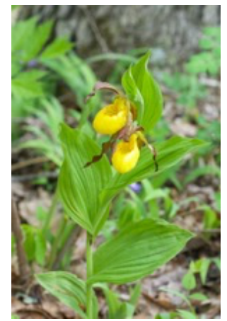
Cypripedium parviflorum var. pubescens, Ohio

So, the question of identification can still be seen in the variety observed among the plants in the species. Some appear to be accurate examples of their named variety and others growing nearby show differences. While some of this variance may come from the growing environments of different plants, consideration must be given to the fact that pollinators do not pay attention to plant names as they go about their life. So, some of this variation may be breeding related. Ben Rostron has extensive examples in photos from plants found in Canada. The links will show this. I'm so envious of the people living where these plants grow in abundance <a href="https://www.flickr.com/photos/ab_orchid/albums/72157647414476446">https://www.flickr.com/photos/ab_orchid/albums/72157718189598138</a>