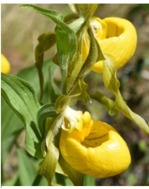
Cypripedium parviflorum var. pubescens showing hairs on petals and bracts.

"An old Ojibwe legend tells of a village visited by plague. It was the dead of winter and many died, including the village healer. To save the community, a young girl made a dangerous journey through the snow to find medicine for the sick. She succeeded, but on the way lost her moccasins, leaving a trail of bloody footprints in the snow. When spring arrived, the bloody footprints put forth moccasin flowers, better known today by their Western name, the lady's slippers." 1