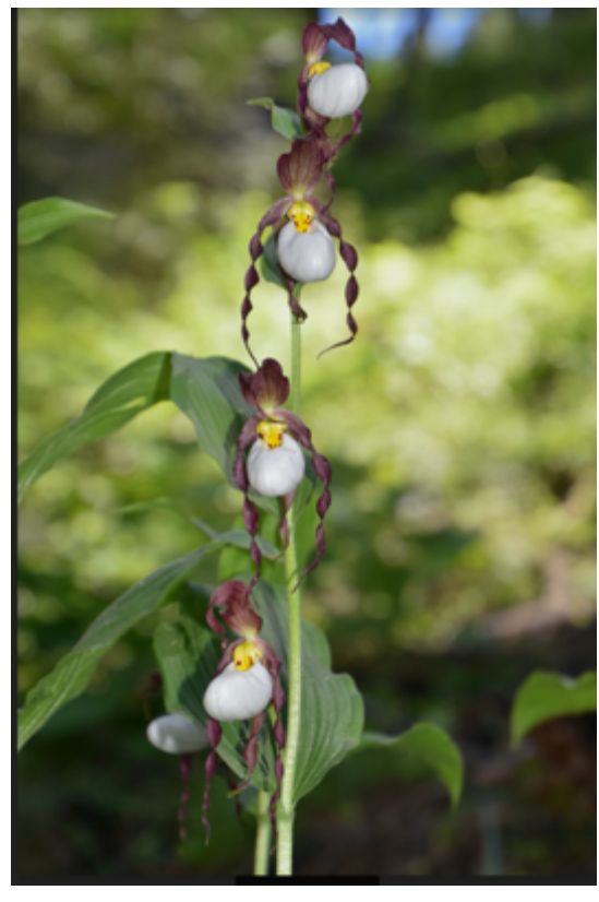
Cypripedium montanum, California