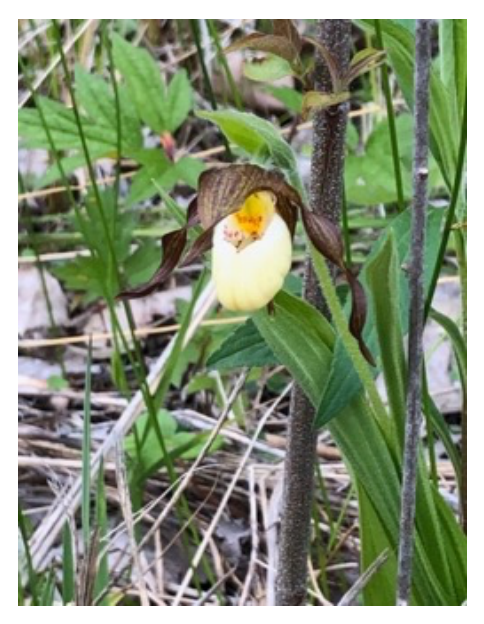
Cypipedium x andrewsii Castalia, Ohio

The second site is in Michigan and again this time we only found one parent, Cypripedium parviflorum var. makasin . This site is much more shady and almost swampy. The plants are mostly found on raised sunny hummocks in the surrounding swamp.