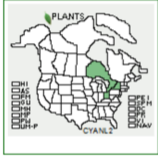
Cypripedium ×andrewsii var. landonii [× andrewsii var. favillianum × parviflorum var. parviflorum ] hybrid ladyslipper