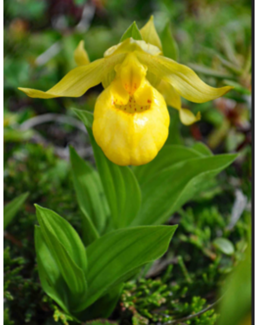
Cypripedium parviflorum var. pubescens Newfoundland, Canada, Photo by Susan J. Meades 14 (be sure to check website)

lady's slippers or the single species Cypripedium calceolus arguing the number of varieties and which were species. The main arguments for a single species were: 1) the variation observed is due to hybridization among the various forms or, 2) as Carlyle A. Luer thought, a single species complex undergoing active speciation with three varieties: pubescens, parviflorum and planipetalum . In 1985 J. T. Atwood separated the North American group into four species based or flower differences: Cypripedium pubescens, Cypripedium parviflorum Cypripedium planipetalum, and Cypripedium kentuckiense .