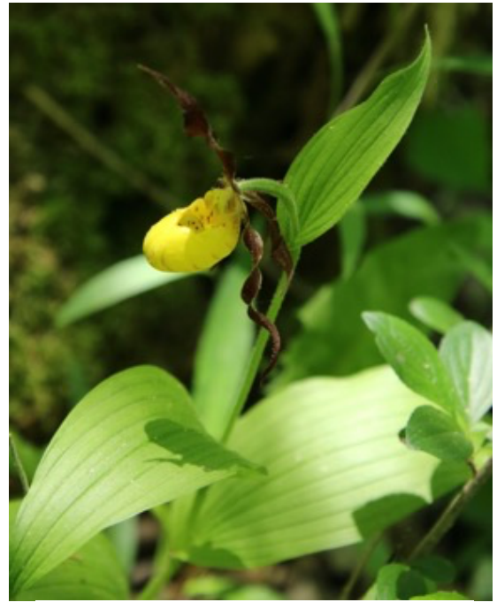
Cypripedium parviflorum var. makasin, Waterloo, Michigan

The second site is in Michigan and again this time we only found one parent, Cypripedium parviflorum var. makasin . This site is much more shady and almost swampy. The plants are mostly found on raised sunny hummocks in the surrounding swamp.