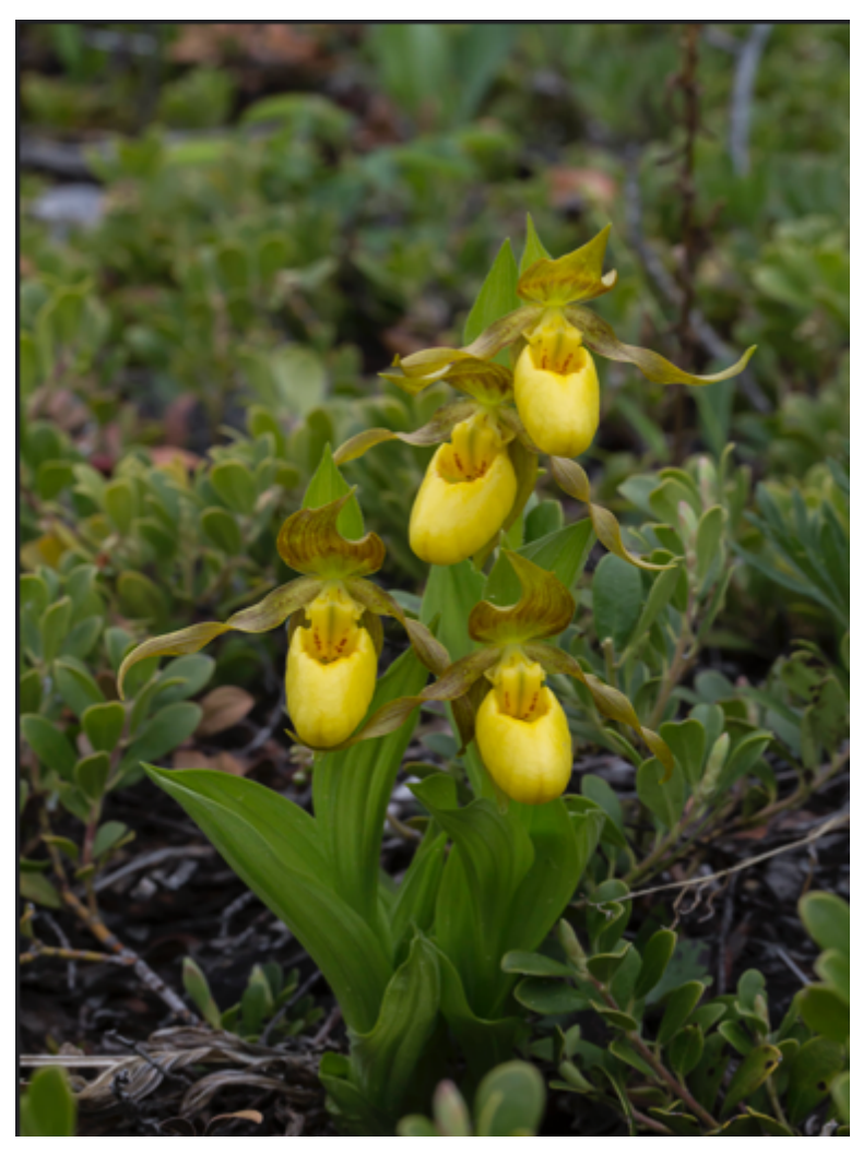
Cypripedium parviflorum var. exiliens , Alberta.

"Perennial herb from slender rhizomes and coarse, fibrous roots; plants small, slender.