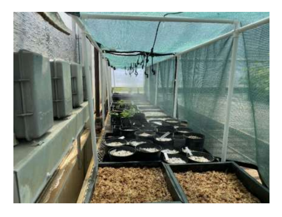
Figure 2. Shade/misng structure in operation, already full of propagation material.