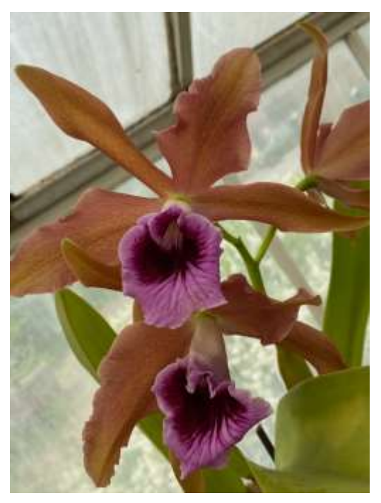
Cattleya tenebrosa (1891)