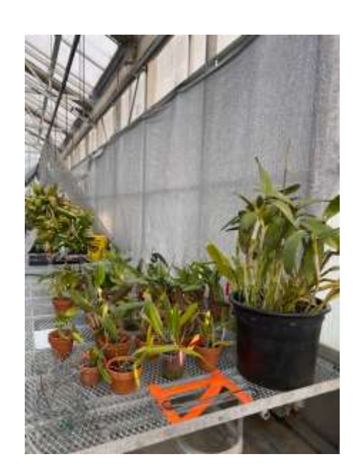
Cattleya's in new space