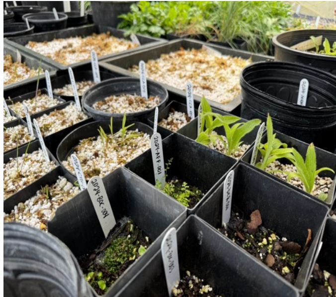
Figure 2. Multiple species, including Cypripedium reginae , Cypripedium candidum and Malaxis unifolia growing under the misting system.