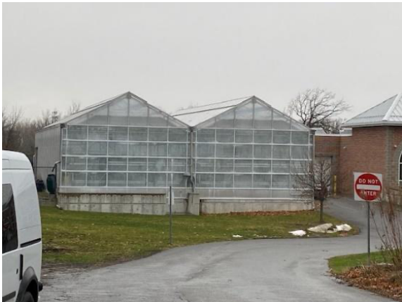
Orchid grow house on the left