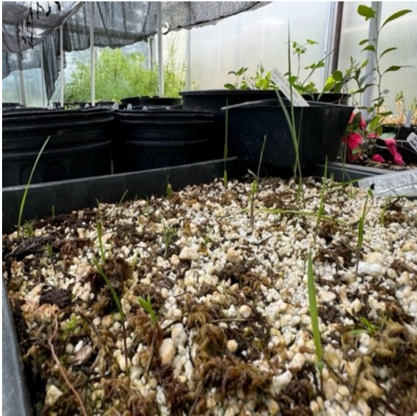
Figure 1. Calopogon tuberosus seedlings growing under misting system. Seedlings have been more numerous and more vigorous with new two-tier system.