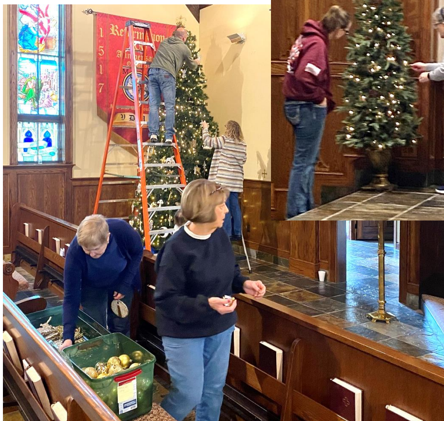
Thanks to all who came out for the church decorating.