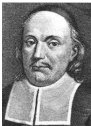
Paul Gerhardt 1607-1676

I often get this question: "Kantor, what is your favorite hymn?" This is a fair and honest question, after all, I may seem supremely qualified to offer this input knowing that my opinion comes off the back of ten years of playing the hymns, six of those years being regularly for a Church job. In addition, my time at the University included hours of hymn study and hymn playing strategies, practices, techniques, ideas. This is, of course, all in addition to my personal appreciation and love for our Lutheran "canon" of hymns. However, as many of you who have asked this question in the past know, the answer is this: "I don't have a favorite, there are too many to choose from. However, my greatest appreciation is for the hymns of Paul Gerhardt." Many are familiar with the name, some are familiar with his vocation as a Pastor in Germany and the societal circumstances which he had seen throughout his life. Because of great turmoil and rampant death during his lifetime, Gerhardt's hymns preach to a different Christian than those of Luther and the Reformation Era. Instead of a militant and godly-rebellious people, Gerhardt is the Shepherd of the defeated and dying. This has created a totally different affect in his work. Next time you see Gerhardt's name at the bottom corner of the hymn page, of the language used. Call to mind Luther's classics, and search for those affective differences which Gerhardt and Luther showcase.