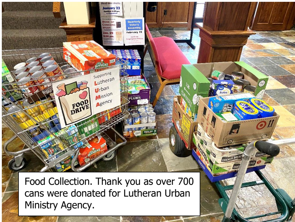
Food Collection. Thank you as over 700 cans were donated for Lutheran Urban Ministry Agency.