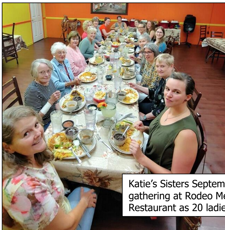
Katie's Sisters September gathering at Rodeo Mexican Restaurant as 20 ladies came out.

No October gathering. All are invited as we will gather at the first Friday of the month to address various little projects, maintenance, or enhancements inside and outside the church. We will grab some coffee, and work until 9-9:30 am.